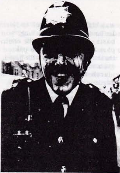
having a good time?