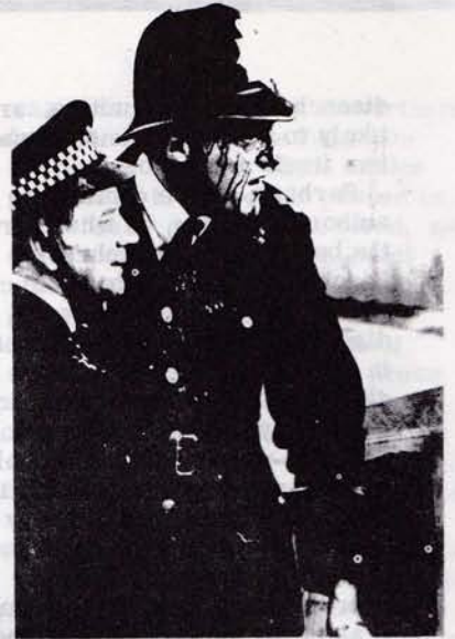
The much-propagated face of that heroic constable . . .