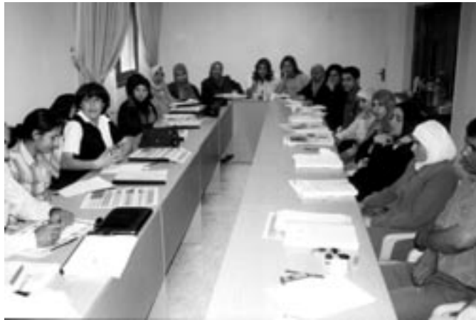
Empowerment of Young Leaders. Dialogue Session June 2, 2004 - Jenin.

{Effective dates of project: November 1, 2003- September 30, 2004}