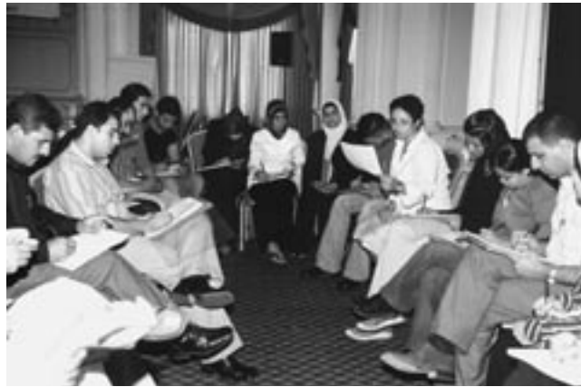
Empowerment of Community Leaders. Oct. 7, 2004

MIFTAH's project The Empowerment of Young Community Leaders in the West Bank and Gaza aims at empowering young Palestinian community leaders. The objectives of the project include identifying the needs of young community leaders, building their capacity,