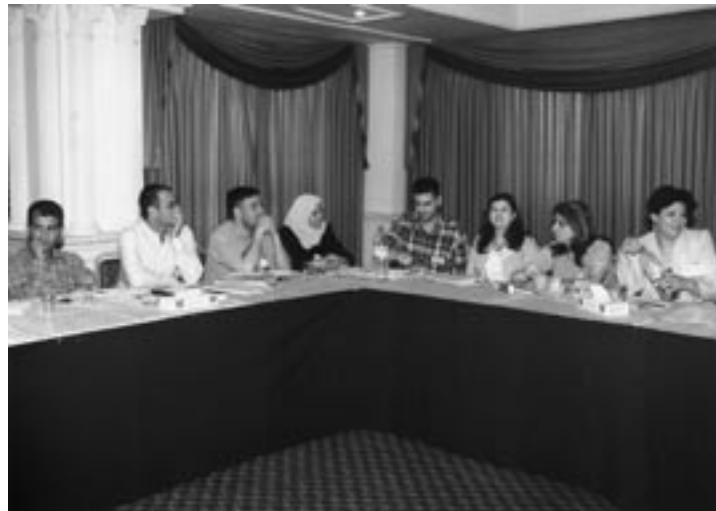
Empowerment of Young Palestinian Leaders. May, 2004

As part of its plan to raise the awareness of young community leaders on issues of democracy, good governance, women's rights and citizenship, MIFTAH prepared an Information Kit made up of a collection of articles and statistics from different sources including the internet,