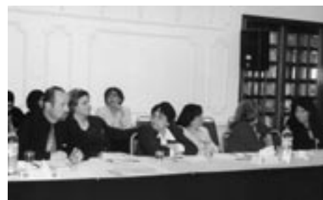
Women and the Contingency Work Opportunities, July 29, 2004

A mini-conference on contingency work opportunities was held on July 29, 2004 at the Best Eastern Hotel