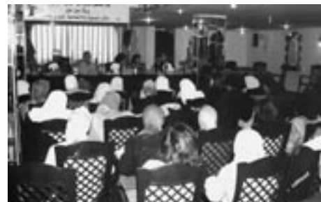
Workshop Raising the Age of Marriage

Three mini-conferences on the social, medical, and religious effects of early marriage were held in Nablus, Hebron, and Gaza. The conferences were implemented in coordination with Hawa Centre in Nablus, PFPPA in Hebron, and Women's Empowerment Project in Gaza. More than 180 participants, including PLC members, attended.