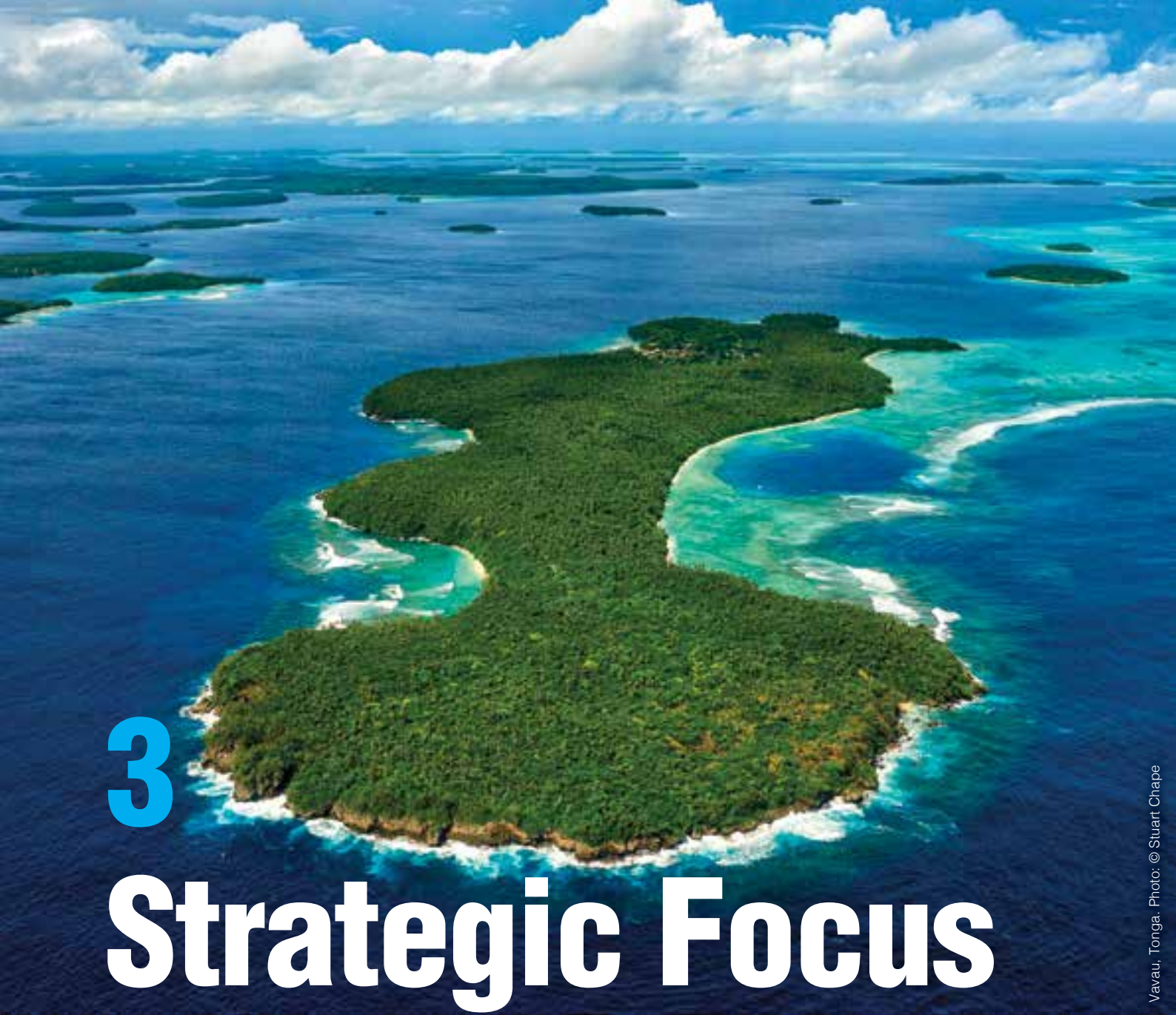
Vavau, Tonga.