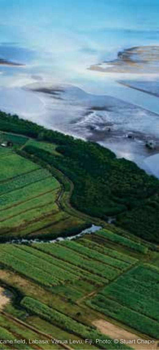
cane field, Labasa, Vanua Levu, Fiji.