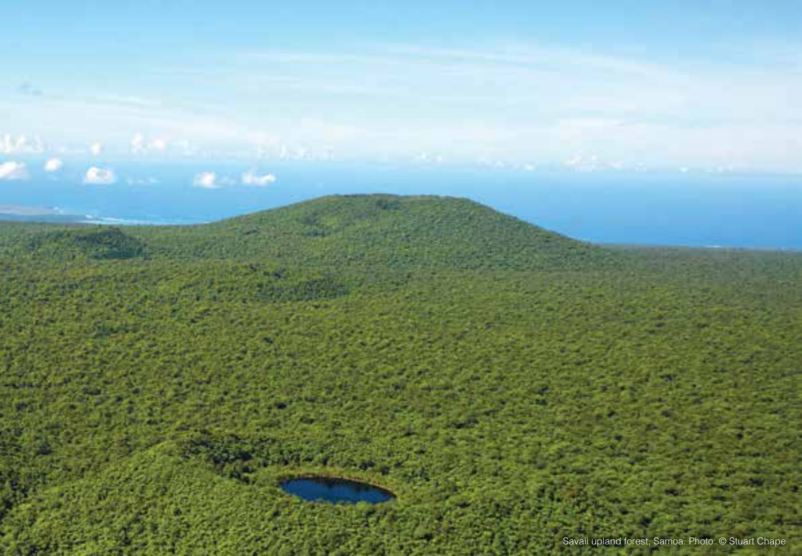
Savaii upland forest, Samoa.