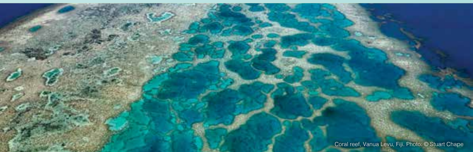
Coral reef, Vanua Levu, Fiji.

The Secretariat hosts technical expertise in a wide range of oceans issues. In anticipation of the increasing severity of ocean ecosystem impacts, especially from climate change, SPREP is committed to increasing its capacity to address ocean issues and to collaborating with Members, CROP agencies, and supporters to protect the health and resilience of our ocean for the benefit of SPREP Members and future generations.