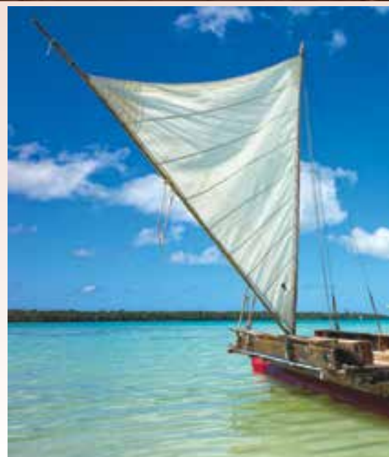
Canoe, New Caledonia.

S PREP approaches the environmental challenges faced by the Pacific guided by four simple values. These values guide all aspects of our work.