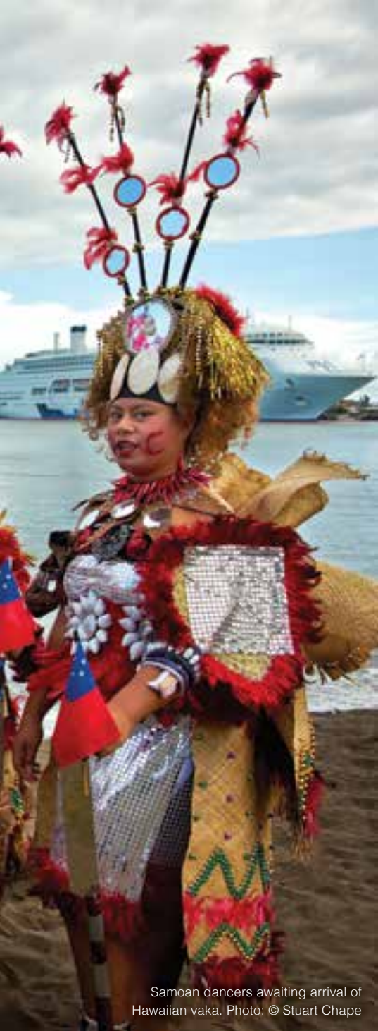
Samoan dancers awaiting arrival of Hawaiian vaka.