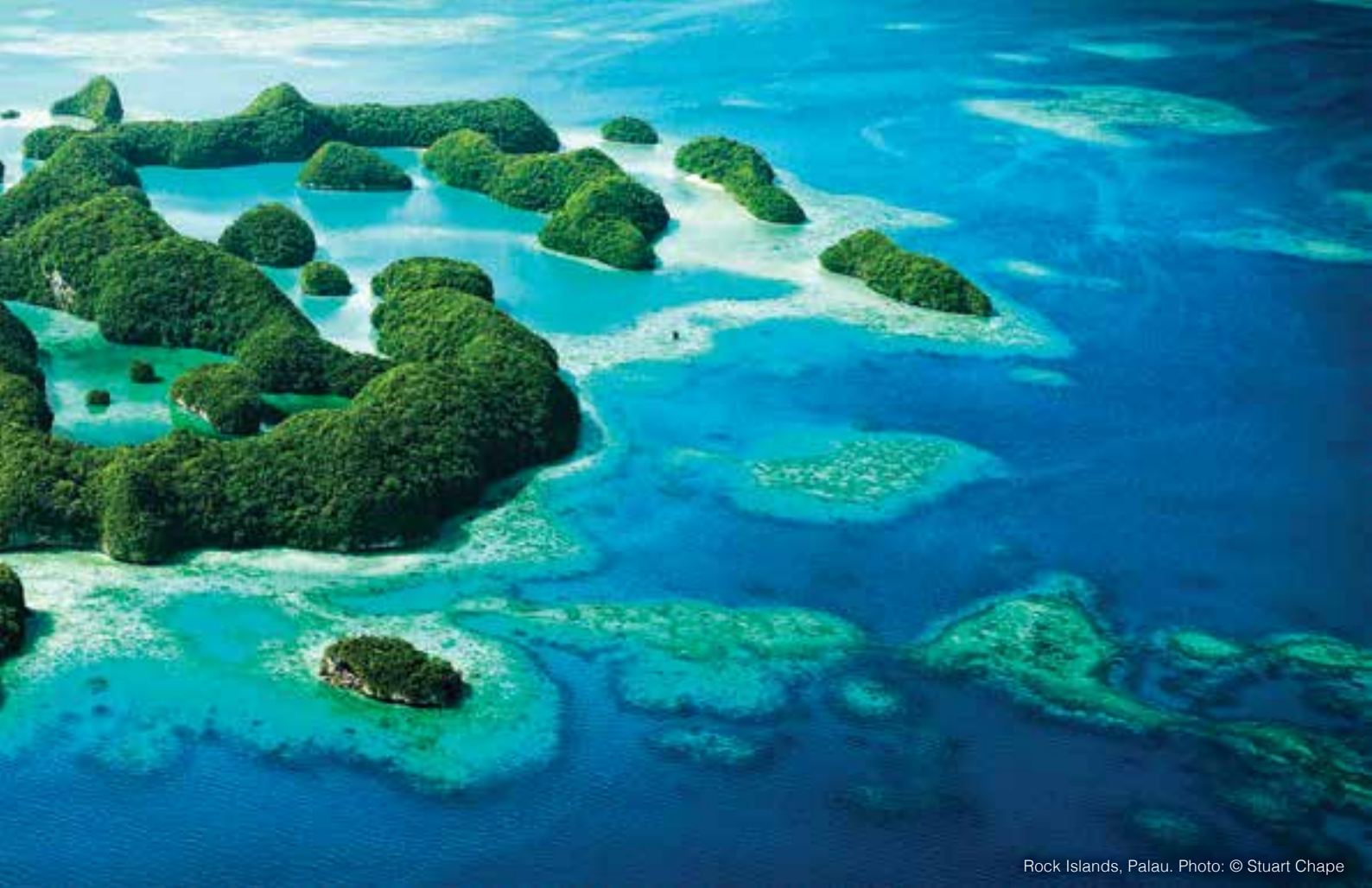
Rock Islands, Palau.

coordinated regional responses to global issues and international agreements.