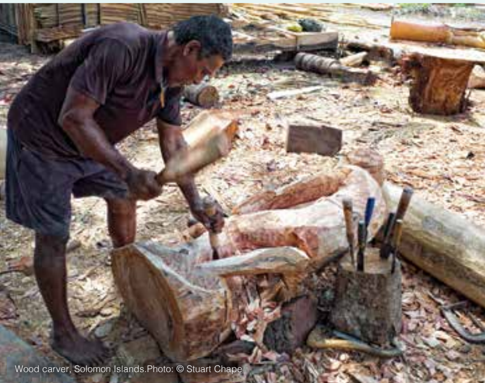
Wood carver, Solomon Islands.