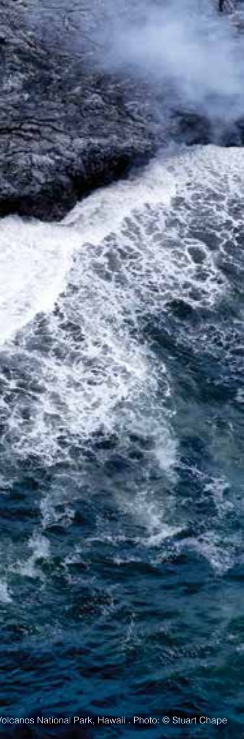
Volcanos National Park, Hawaii .

REGIONAL GOAL 1: Pacific people benefit from strengthened resilience to climate change