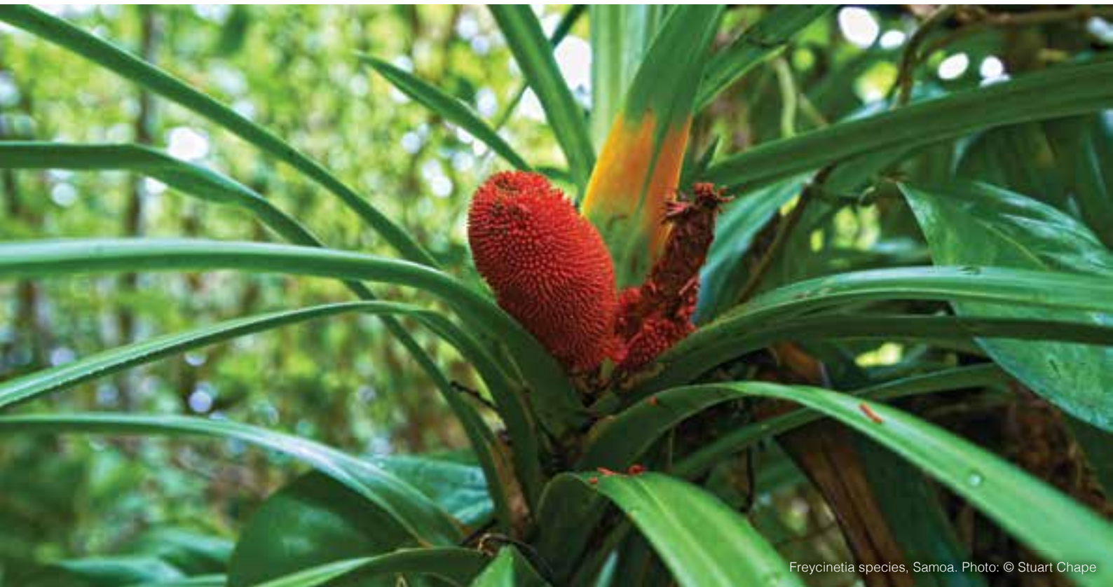
Freycinetia species, Samoa.

2.4 Significantly reduce the socio-economic and ecological impact of invasive species on land and water ecosystems and control or eradicate priority species.