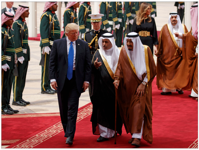
Congress must demand concrete assurances from the Trump administration that the arms sale to Saudi Arabia will not undermine the Israel Defense Forces' qualitative military edge.

On the heels of the Obama administration's 2016 announcement of significant military exports to Saudi Arabia, President Trump announced in May that the United States will sell it over $110 billion of arms. Such an enormous quantity of defense materiel sold to a country still technically at war with Israel—despite common interests in blocking Iran's regional aggression—raises serious policy concerns, especially when it comes to the maintenance of Israel's QME and a stable Middle East military balance.