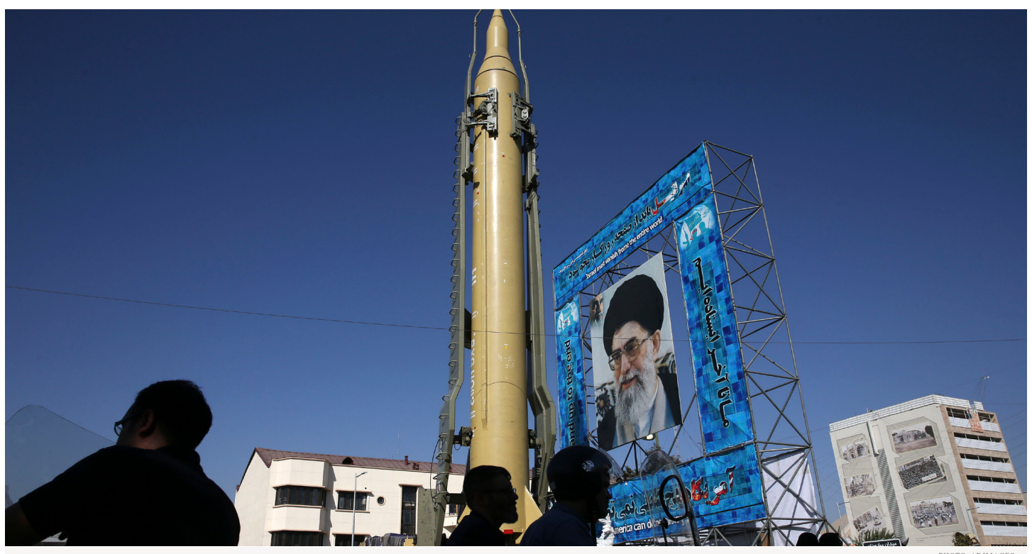
On June 15, the Senate overwhelmingly adopted bipartisan legislation in a 98-2 vote that would impose sanctions targeting Iran's ballistic missile program, its destabilizing actions in the Middle East, its human rights abuses, and its conventional weapons trade. Directed exclusively at Iran's non-nuclear regional aggression, it in no way does it violate the letter or spirit of the 2015 Iran nuclear deal.