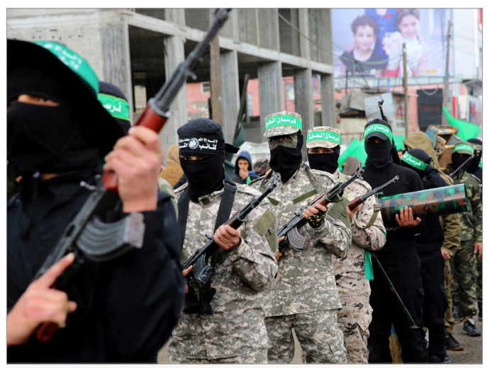
Hamas rule has only brought suffering to Gaza, as Hamas has prioritized attacking Israel over providing for Gaza's nearly two million residents.

While Fatah initially refused to cooperate with the Hamas-led government, it ultimately joined the terrorist group in a unity government in March 2007. But relations worsened and violence between the two sides broke out in June 2007. Hamas ultimately succeeded in evicting Fatah from Gaza following a battle that left 161 Palestinians dead and over 700 wounded. In a brutal display of violence, Hamas militants threw Fatah members off rooftops and executed others in the streets.