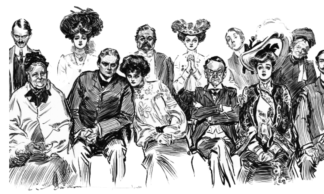
A jury of your peers

I see how I needed every moment of that build up, all of the reinforcement of self that I put into the previous ten years to get me through the experience intact. When the focus of the radical left had moved on to the next crisis, when I hadn't seen my dearest friends in years, when I was puking blood from a mysterious illness with no way to see a doctor, when I didn't even have my own name to give coherence to my words, what I did have to hold onto was the promise I had made to myself—and implicitly to all others engaged in struggle—that I would put everything I had into the fight. Prolonged psychological dissonance can really disorient, subjecting what seems like our strongest foundations to deterioration. Anarchy became the one place to which I could