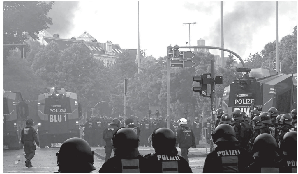
Schanze, police-free zone, on the horizon.

Another demonstration had originally been called for 8 pm on the Reeperbahn by an authoritarian communist group, but they had canceled it. Nevertheless,