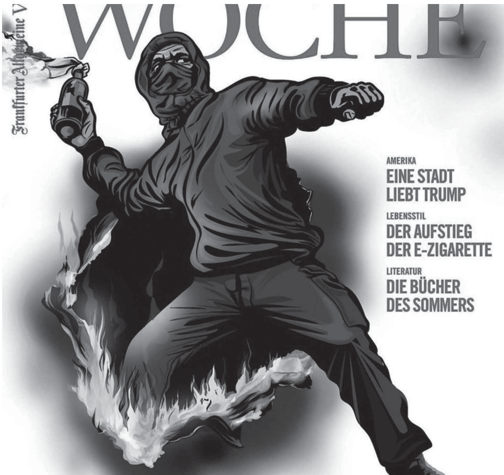
Fearmongering after the G20.

An upheaval like the G20 offers aspiring tyrants opportunities, but it also offers us opportunities to argue for collective self-defense and to expand the popular imagination when it comes to resistance. The legacy of the 2017 G20 will be determined now, afterwards, in what we remember from it, what we learn from it, and how we use it to spark the conversations we want to have. The first step is to support the arrested and injured and orient ourselves in the current public discourse so we can use the events of the G20 to delegitimize capitalism and the state, rather than letting them use this opportunity to demonize us.