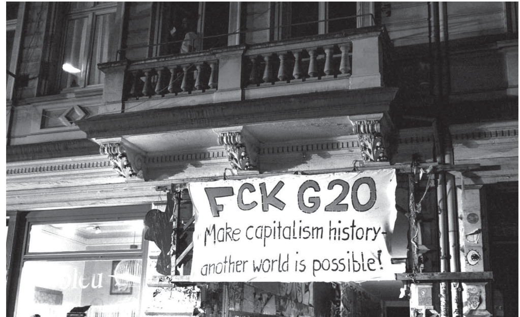
Signs like this hung all around St. Pauli ahead of the G20.

We ended up in front of a Greek restaurant in the Schanze neighborhood. The family that owns it is sympathetic to the demonstrations; the father is a communist, the son an anarchist. Demonstrators helped them move their tables inside as riot police begin to carry out charges down the street. This is typical for Hamburg: larger conflicts often spill over to this intersection, and the police always position a squad here.