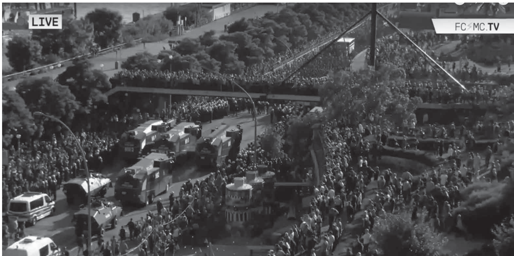
This photo shows the lines of spectators surrounding the police positions around the Welcome to Hell demonstration.

the lines of spectators—but every time they did, more spectators gathered to watch them. The police who had hoped to surround and isolate the radicals were themselves surrounded by society at large. As of that moment, the spectators were really just that, spectators: attempts to lead chants among them fell flat. But they were watching, and the police were watching them.