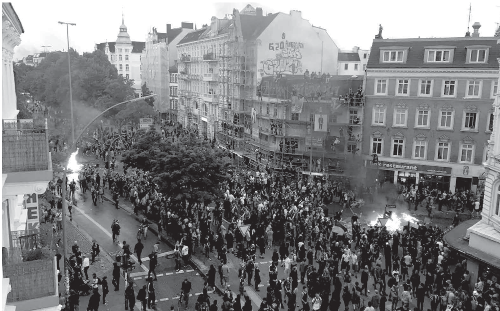
The burning barricades at the intersection of Neuer Pferdemarkt, Schulterblatt, and Schanzenstrasse.