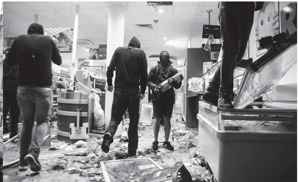
Everything for everyone: demonstrators looting one of the few shops in Schanze that didn't put up a sign expressing opposition to the G20.

There were hundreds of police charging back and forth at this intersection, but they were exhausted and stretched thin. When they switched out one squadron for another, we took advantage of the opportunity to rush across the street. Suddenly, we were on the other side of their lines, where courageous demonstrators had been keeping the water cannons at bay with a steady rain of projectiles.