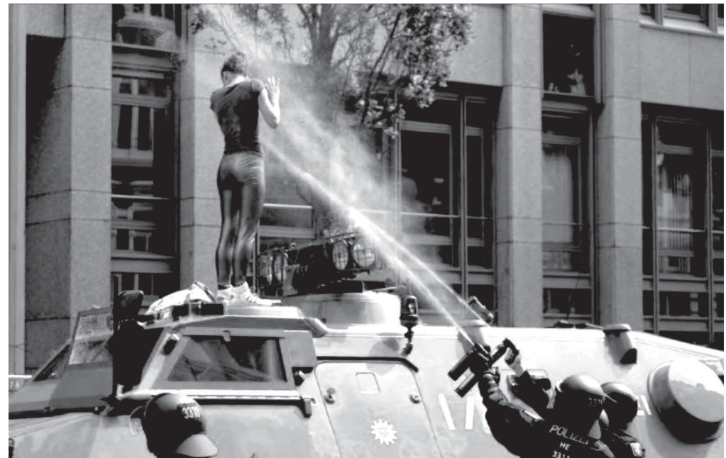
In response to creative blockading tactics, all the police could come up with was—more pepper spray.

Meanwhile, at a press conference at the media center at Hamburg's world-famous St. Pauli stadium, representatives of Welcome to Hell, Block G20, Solidarity without Borders, and other groups presented a unified front in condemning the previous evening's police attacks, emphasizing that it was only a matter of good fortune that the police had not killed anyone and declaring that the protesters would not be divided. When a journalist from the conservative media outlet NDR attempted to foment division by alleging that he had read criticism of the Welcome to Hell march on the Facebook page of another protest group, Right to the City, a representative of that group stood up from the audience and repudiated his insinuation, forcefully asserting their solidarity with the other groups.