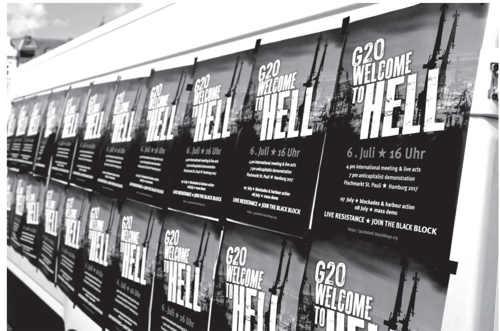
Welcome to Hell posters blanketed Germany for months before the G20.

"Is your Internet not working, too?" asked a journalist from the mainstream media. "It suddenly slowed down for no reason. I have tons of data!" He was worried he wouldn't be able to livestream the upcoming demonstration. Many journalists around us were facing the same problem. At that point, we had no idea how determined the police were to discourage the press from filming. Hours before anything started, tension was already thick in the air. Everyone was watching the time, waiting for 4 pm.