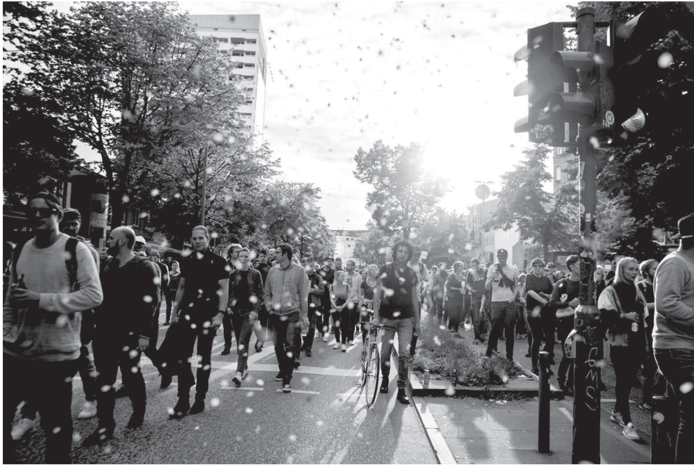
The mobile dance party on Wednesday, July 5

At the time, the police seemed unbeatable, though the locals were making an honorable effort to put up a fight. Little did we know that just three days later, we would watch a joyous Critical Mass of bicyclists pass through this intersection while barricades burned at all the access points to the neighborhood and Schanze was a police-free liberated zone.