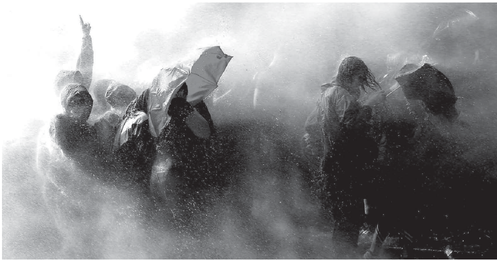
Standing up to the G20 in Hamburg.