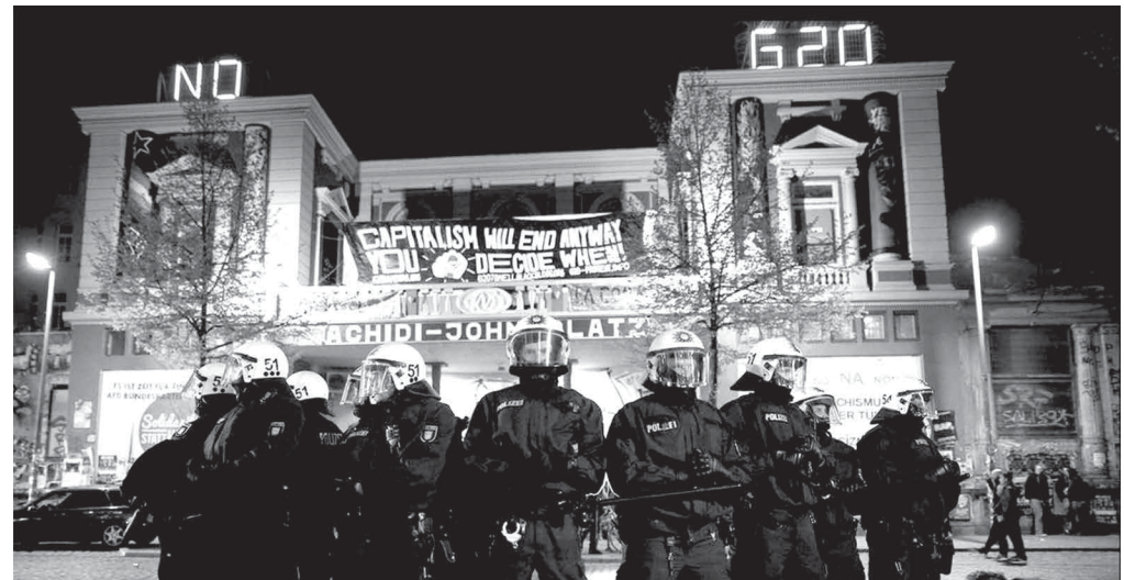
Police in front of Rote Flora ahead of the G20.

“In the US, there would be no ambulance,” I explained.