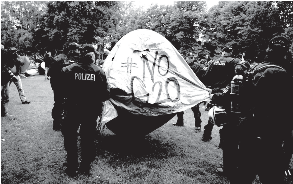
Anti-tent raid on Tuesday, July 4.

The police raid on Entenwerder Park and the unprovoked attack on the Welcome to Hell demonstration four days later fit seamlessly together: they are two examples of a single strategy. It was not about what happened in the foreground but the effects. The point was to discourage people from participating in the protests against the G20 summit. The attacks clearly had nothing to do with the behavior of the demonstrators; in retrospect, they appear choreographed. They attacked the camps in order to convey the impression that there were no safe places in Hamburg for out-of-town demonstrators to go.