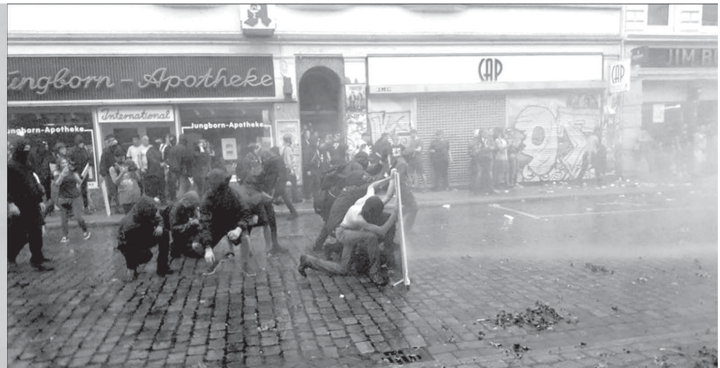
Clashes in Schanze, Friday, July 7.

camaraderie. Many businesses were open, packed with people buying falafel or drinks. As people lined the streets, cheering at the arrival of the bicyclists, it could have been a family-friendly festival. The vast majority of participants were not anarchists or foreigners from Southern Europe, but ordinary people from Hamburg who had turned against the police over the preceding week. Outside of Schanze, even in areas where there were no anarchists, locals pulled their own trashcans into the street, forcing the police to spread themselves ever thinner over more and more territory.