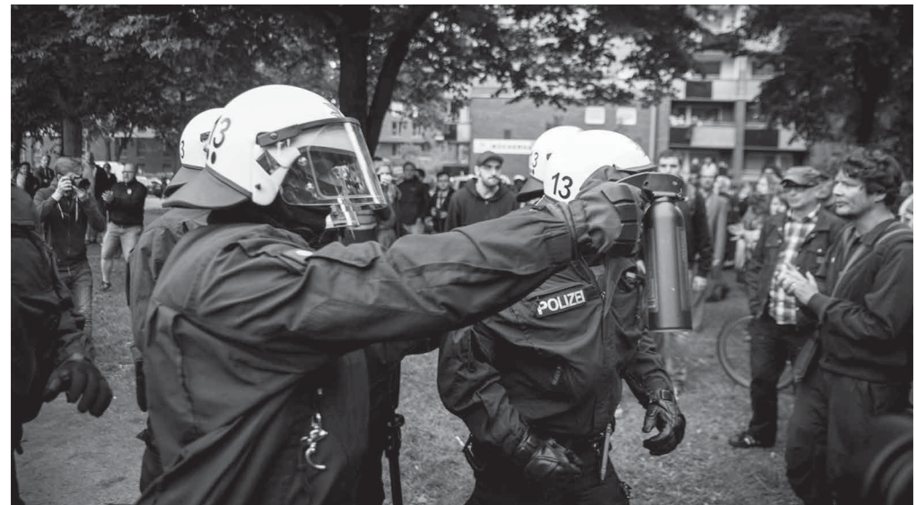
Police getting on well with the locals in Hamburg.

Next, the police presented a detailed media report on how they planned to treat prisoners, even taking journalists into the cells for a photo shoot. They