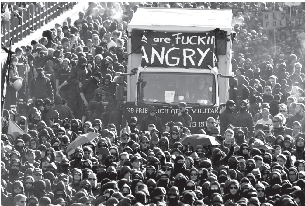
A small portion of the crowd at the Welcome to Hell demonstration.

The news told a different story: “About 220 officers from Berlin were released from duty by the Hamburg authorities after they threw a wild party that involved public sex, brawling, urinating in a group, and a bathrobe-clad officer strip-dancing with her service weapon.”