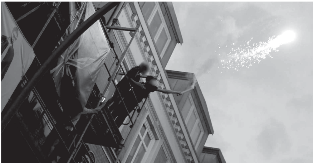
Celebrating in liberated Schanze.