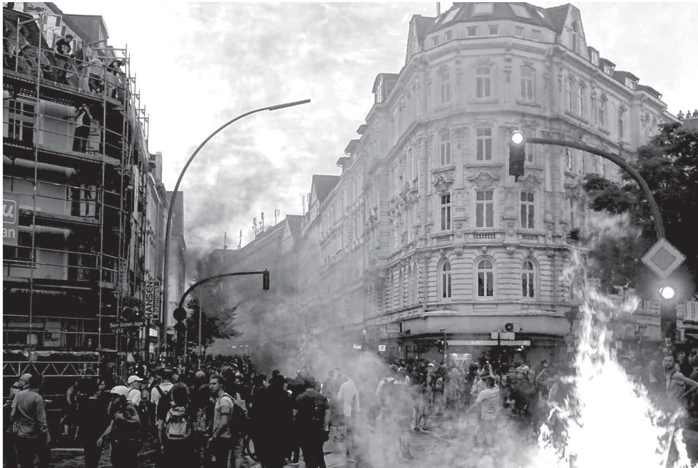
Burning barricades around Schanze on Friday night, July 7.

Bewilderment about the choice of the location created a tense atmosphere in the weeks before the G20, as stories spread about leftist radicals coming to burn down the city. One out of every twelve police officers in all Germany was to be deployed to Hamburg.