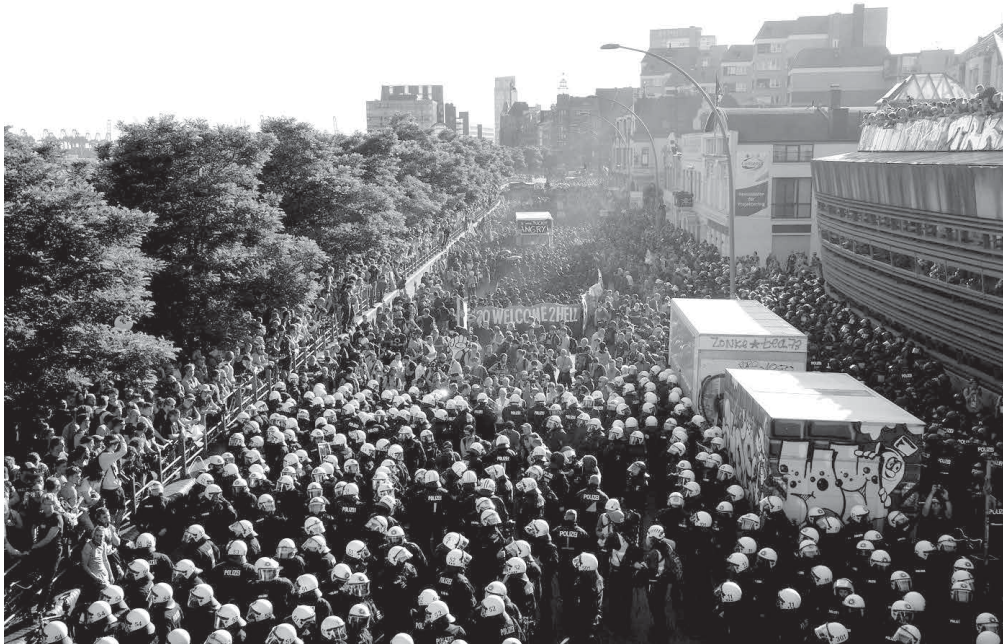
The standoff at the beginning of the Welcome to Hell march.

Around 5 pm, while people were listening to speeches and concerts at the fish market, a spontaneous demonstration of over 500 people began marching