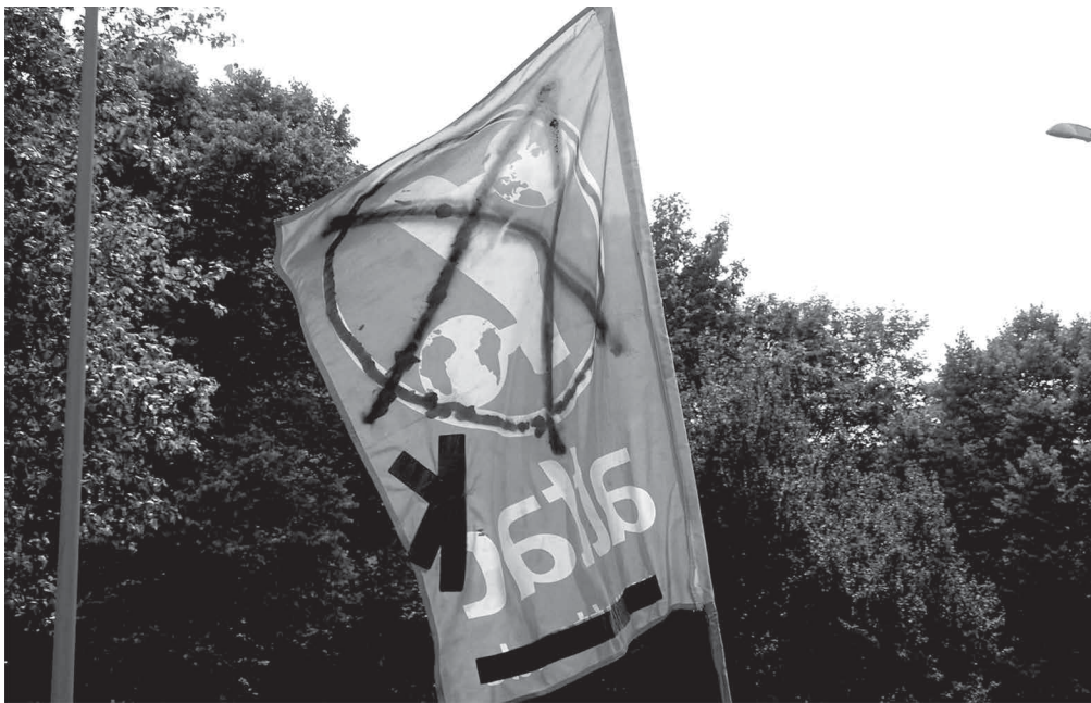
A sign of the times.

Another conservative journalist accused the panelists of “propaganda” for attempting to tell the story of how the police initiated violence the preceding night. It’s a safe bet that he never raised his hand in a police press conference to accuse the police of propaganda, despite the blatant lies that the police spread about the number of injuries suffered by officers at the G20.