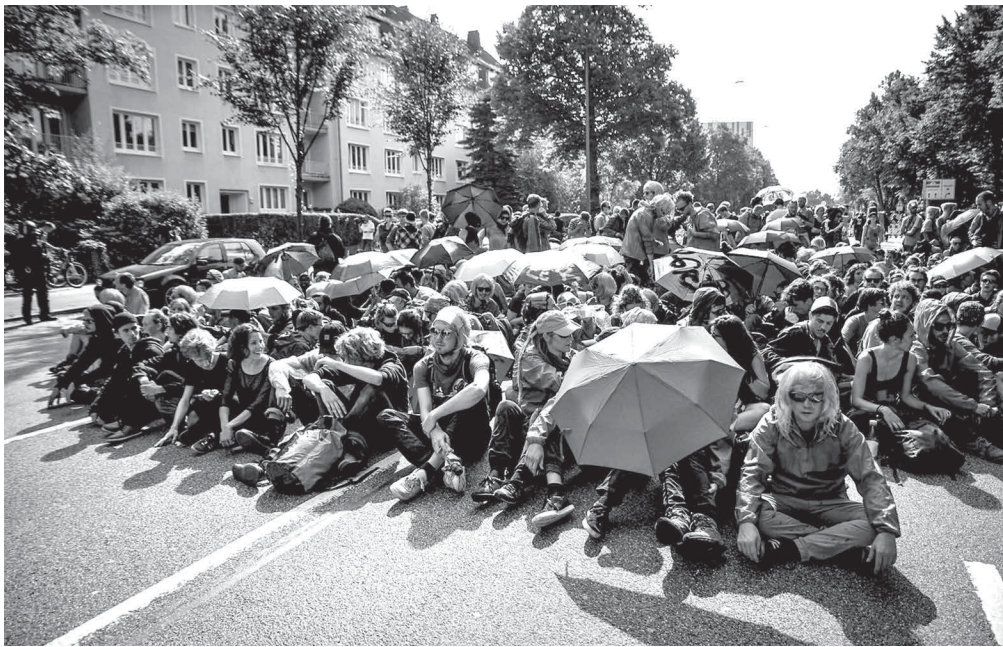
A blockade Friday morning.

at Landungsbrücken, Berliner Tor, Altona, and Hammerbrook. From there, they moved through the city in different directions, carrying out a variety of decentralized actions. Some came close enough to the location of the summit to stop delegates in their vehicles.