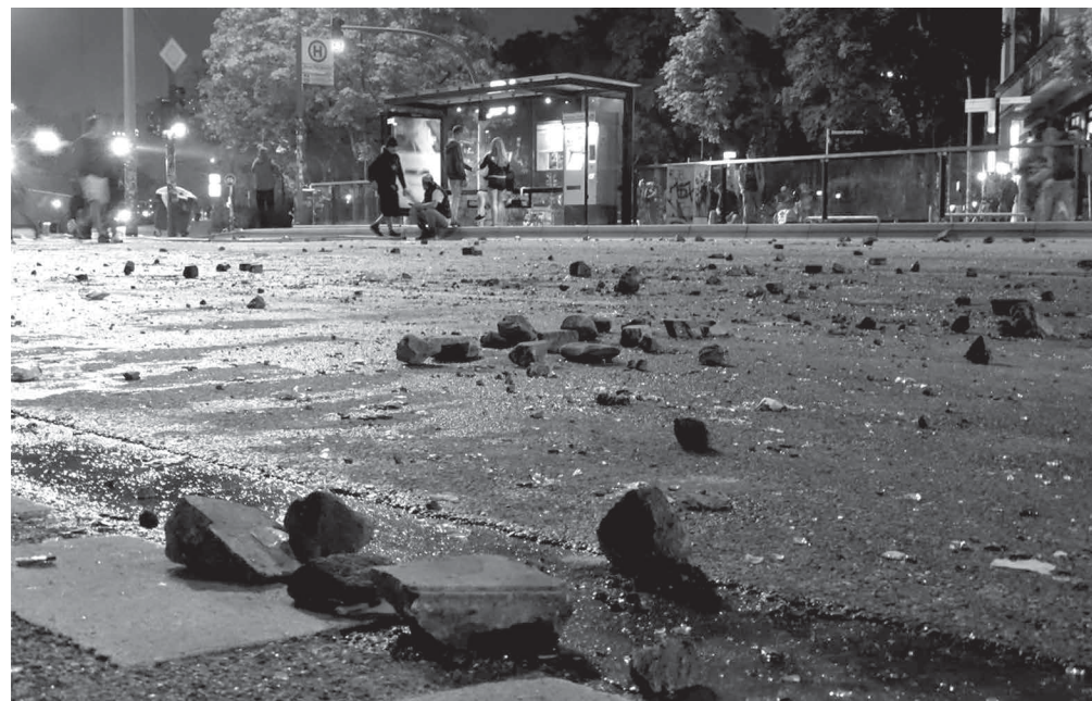
The aftermath on Friday, July 7.

The events of Berlin May Day in 1987 and the 2017 G20 both illustrate a police strategy reaching its limits.