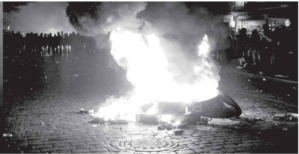
The rebellious streets of Hamburg.