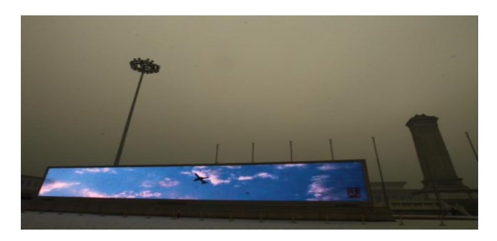
Image 1: "A large TV screen in Beijing's Tiananmen square shows a piece of blue sky against a smoggy backdrop" (published in SCMP 2013).

Another example of the emergence of a narrative that aesthetically politicises the air is the story of Xi's visit to Beijing's Nanluoguxiang district. The visit was covered by state media with photos under the headline: 'Xi Jinping visits Beijing's Nanluoguxiang amid the smog: Breathing together, sharing the fate' (Xinhua 2014) [tong huxi gong mingyun]. It was however not so much his visit to the polluted district which caught the attention of online discussants and commentators as the fact that he entered the heavily polluted area without wearing a face mask. 'Big Xi' was subsequently hailed (both ironically and poignantly) for showing solidarity with the beleaguered local residents. The phrase 'breathing together, sharing the fate' would come to have an enduring effect in cultural imaginations and was recently used as the subtitle of Chai Jing's (2015) widely shared and powerful video documentary 'A shared fate under the dome' [Qiongding zhi xia tong huxi gong mingyun ].<sup>xvi</sup> Care for the air is also a central theme in the documentary which welcomes technological innovation as the antidote against aerial contamination.