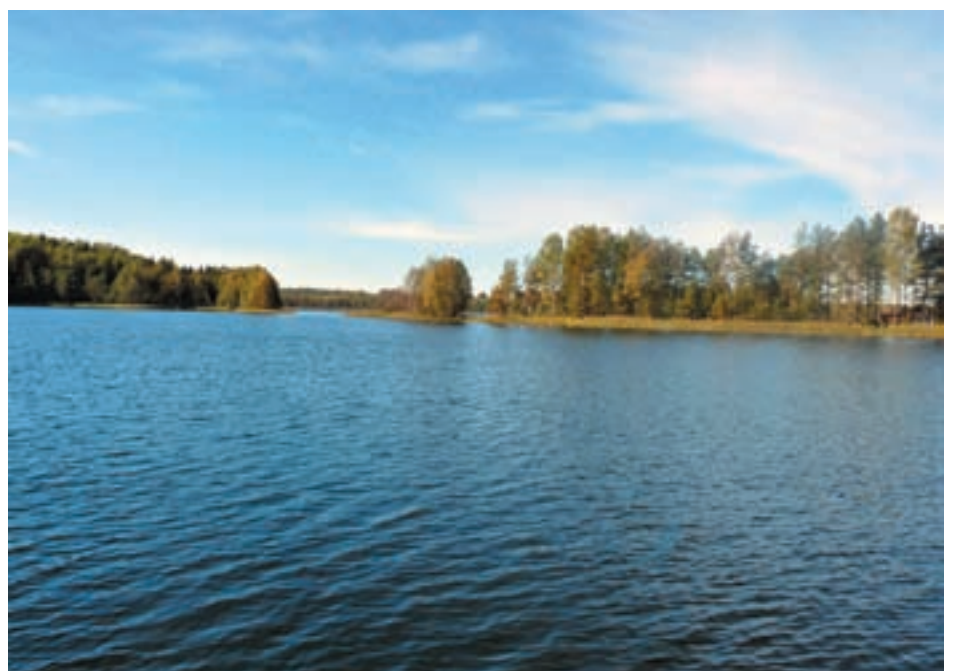
Landscape of the 'Smolensk Lakeland' biosphere reserve

The workshop helped strengthen the cooperation between the Smolensk Lakeland biosphere reserve in Russia and north-eastern border territories of Belarus. The UNESCO Moscow Office supported the continuation of the activity for the establishment of a transboundary territory in this region.