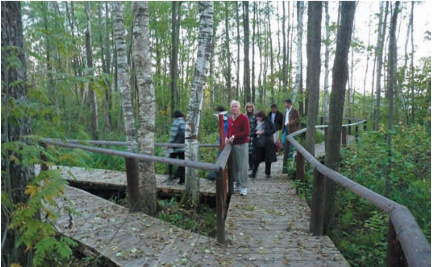
The eco-path in the 'Smolensk Lakeland' biosphere reserve

as model sites, where UNESCO demonstrates the implementation of the sustainability concept, bringing together the biological and cultural conservation with social and economic development of the territory. Although biosphere reserves receive international UNESCO recognition, quite often their status within the national legislation needs more clarification. Unclearly defined status of biosphere reserves might affect their management and significantly hinder the process of their establishment. The workshop participants gave examples of how to overcome those obstacles. They shared an opinion that there was a strong need of legislative acts defining the status of biosphere reserves. Besides legislation the networking and cooperation should be developed both on international and regional levels, because quite often biosphere reserves face the same challenges.