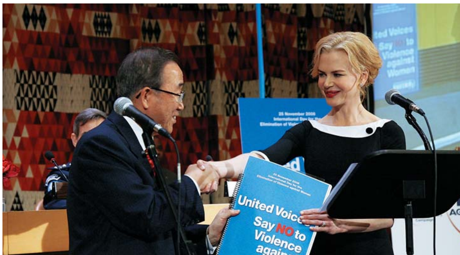
The United Nations Secretary-General Ban Ki-moon greets Nicole Kidman as one of the leaders of UNiTE to End Violence against Women campaign

The collaboration between the UN family and the advertising industry is advancing on many fronts, pointed Mr.