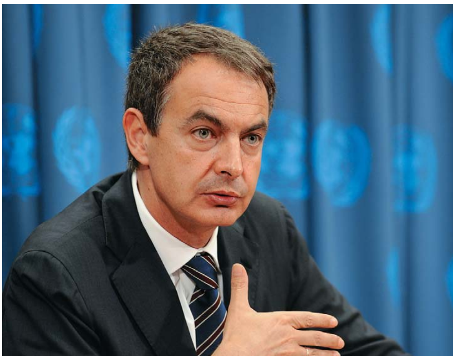
Spanish Prime Minister José Luis Rodríguez Zapatero joined Network of Men Leaders