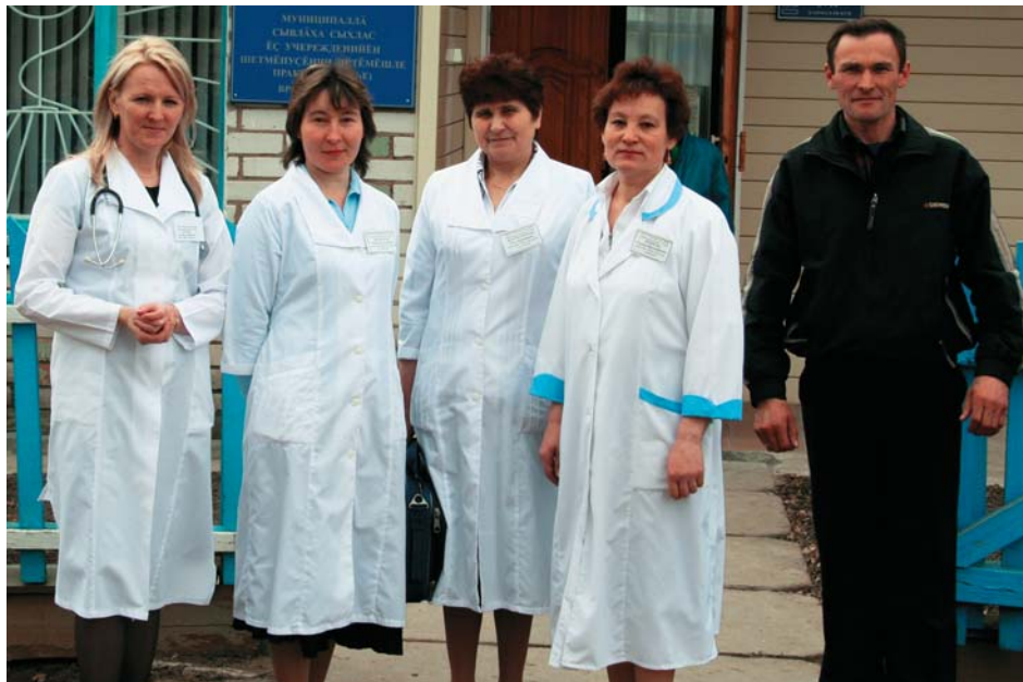
Please meet: here they are, the concerted GP team