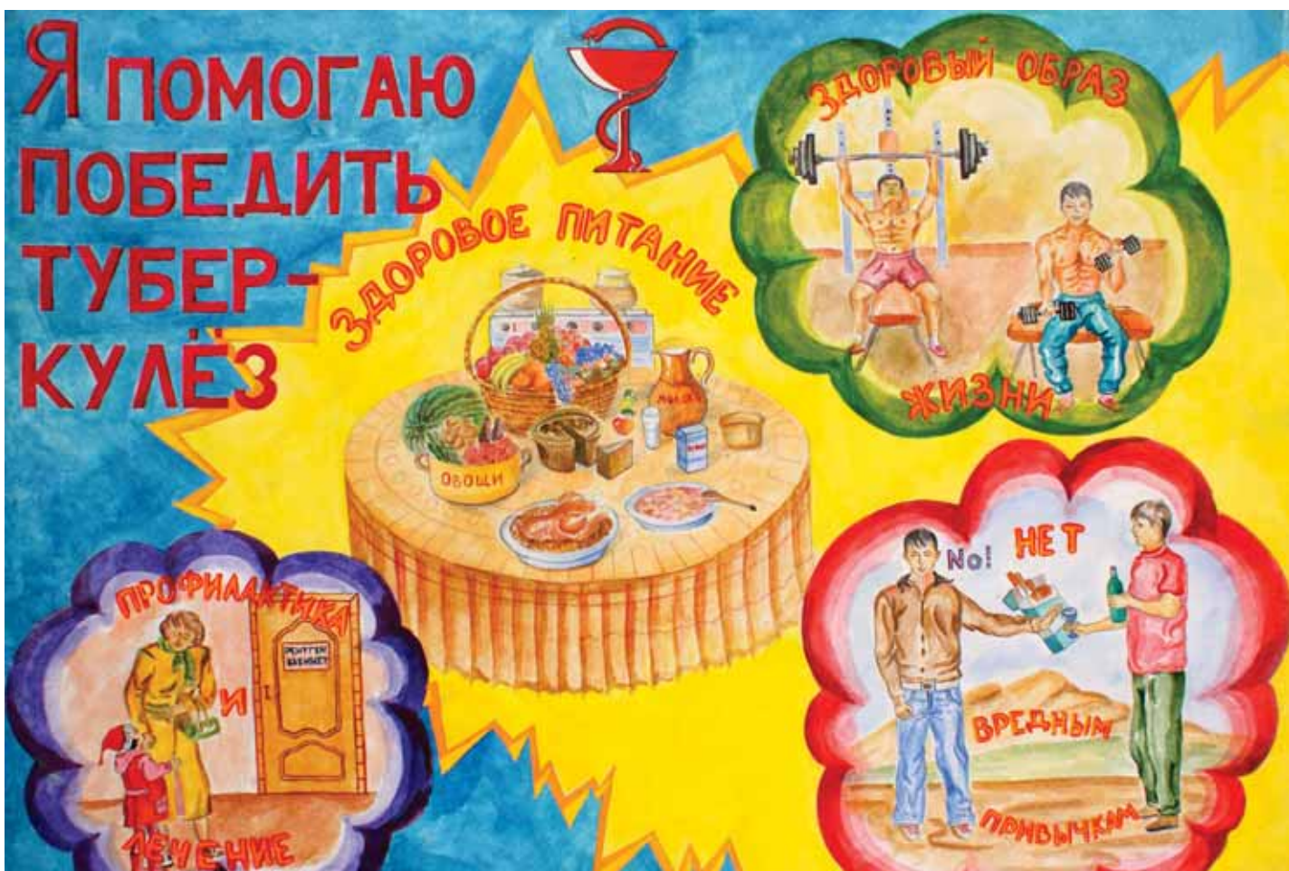
... and his work – winner of the annual poster contest on the occasion of the World TB Day