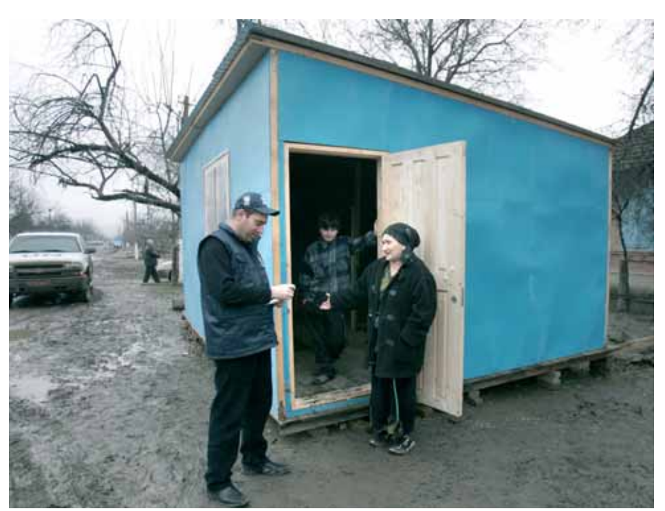
In 2005, UNHCR provided 222 box-tents to returnees to Chechnya

NGOs, conduct their assistance programmes outside either of these frameworks. Thus, the total volume of funds sought by the aid community for 2006 exceeds US$ 120 million. In fact, all these programmes depend upon voluntary contributions of people and private donors, but they have traditionally responded well to the North Caucasus appeals.