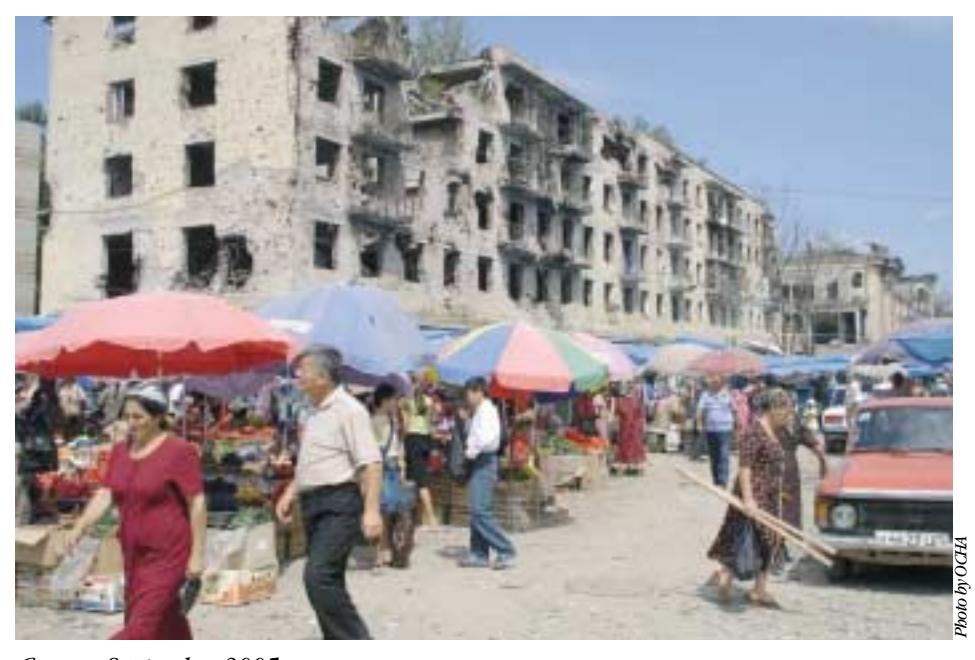
Grozny, September 2005

In the course of an in-depth analysis of the on-going programs and comprehensive assessment of the current needs carried out in cooperation with the authorities the parties reached a mutual understanding that humanitarian assistance in 2006 will be needed in amounts compara-