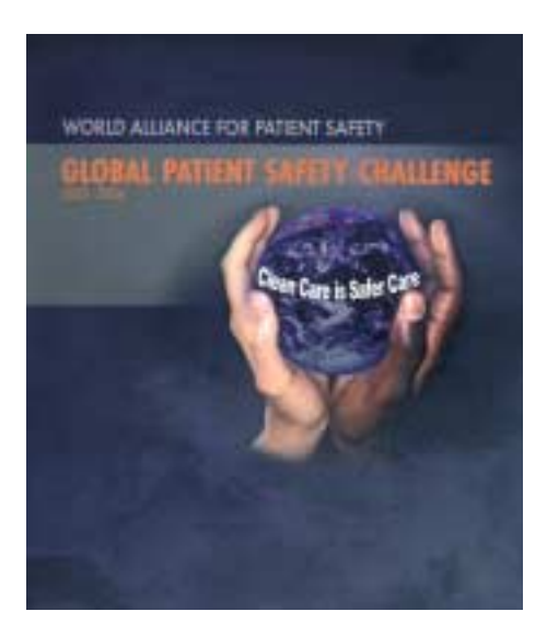
The WHO booklet dedicated to patient safety

None of the health care systems can exclude specific cases of so-called 'adverse events' bringing harm to a patient's health. Therefore more and more countries consider issues of patient safety their top political priority. In 2002, the Resolution of the 55 WHO Assembly called upon all countries to provide support and attention to improve patient safety and facilitate development of monitoring systems in public health care worldwide. This incentive has put patient safety firmly on the global health agenda.