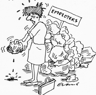
Workers organising in the voluntary and community sector, i.e. getting blood out of stones.

ChildLine is run like an empire by fading TV personality, Esther Rantzen, backed up by a bunch of unelected, unaccountable trustees. Last year, workers were told in an e-mail that they weren't going to get a pay rise for the second year running. No negotiation, no consultation, no nothing. In the meantime, volunteers and casuals are used to fill the gaps left by a freeze on recruitment. Only a new kind of union, and a new kind of workplace organisation can deliver for ChildLine workers. Union and non-union members are already starting to meet informally to discuss the best way to make that happen.