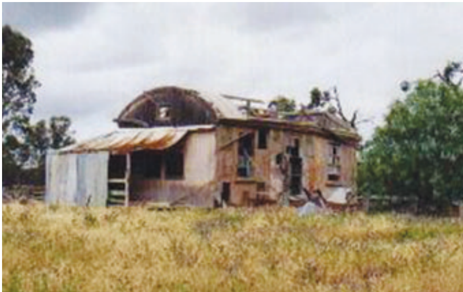
Schoolhouse November 1999