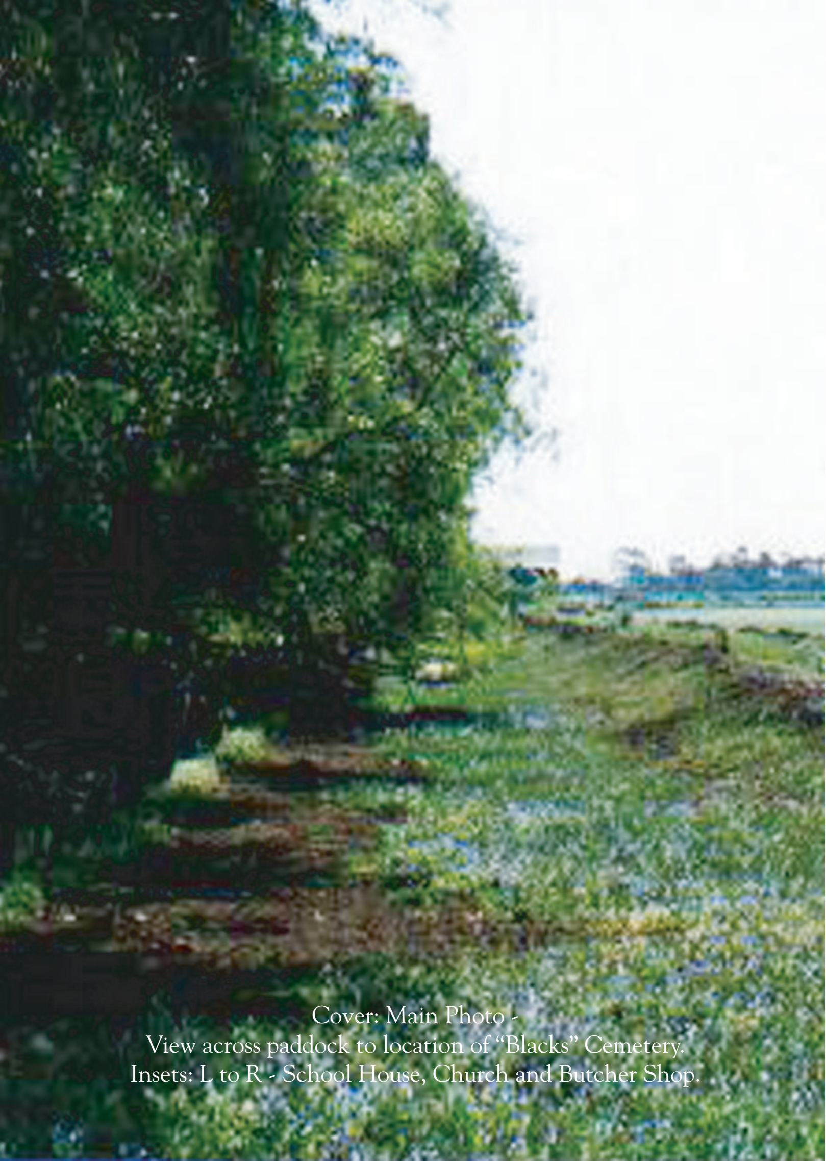
Cover: Main Photo - View across paddock to location of "Blacks" Cemetery. Insets: L to R - School House, Church and Butcher Shop.