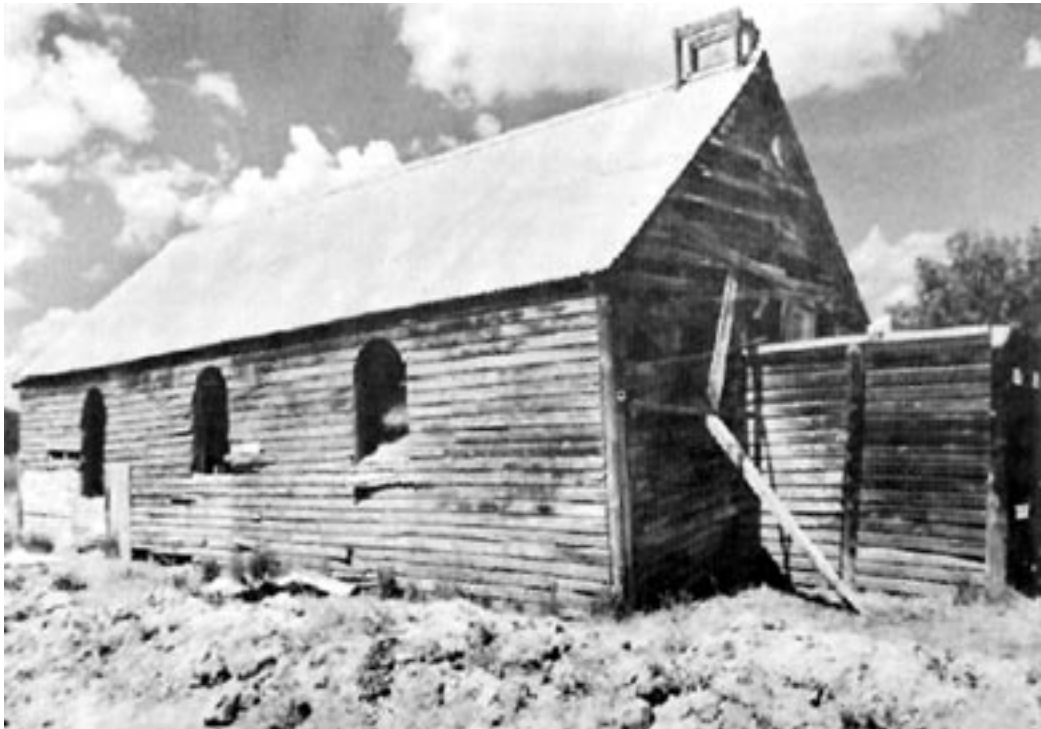
The Church being used as a hay barn in the early 1970's.