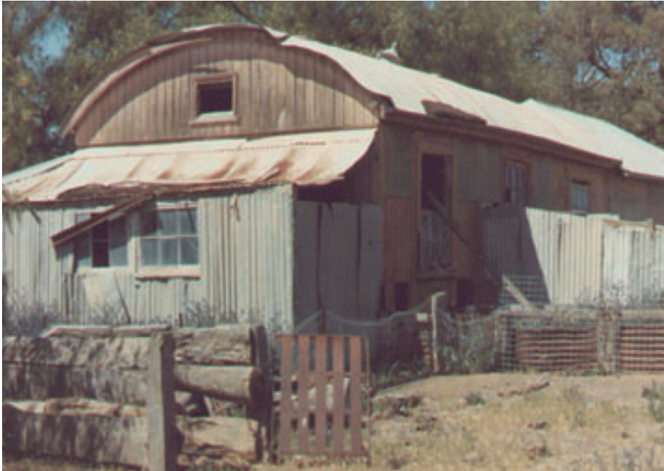
Old school building - metal additions at either end were made when the Station closed to convert the building into a shearing shed.

Photographs taken at Warangesda January 1984