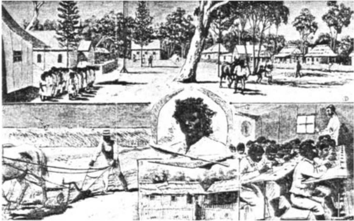
The Sydney Illustrated News, Warangesda Mission 1883