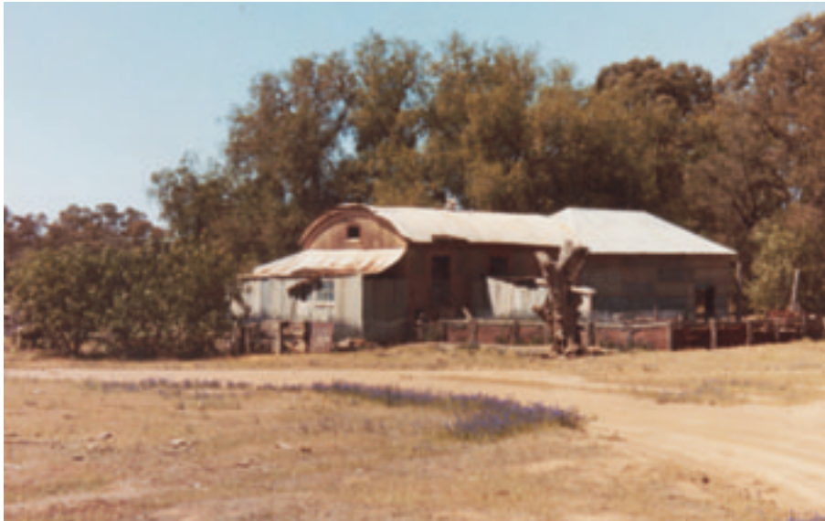
Schoolhouse January, 1984