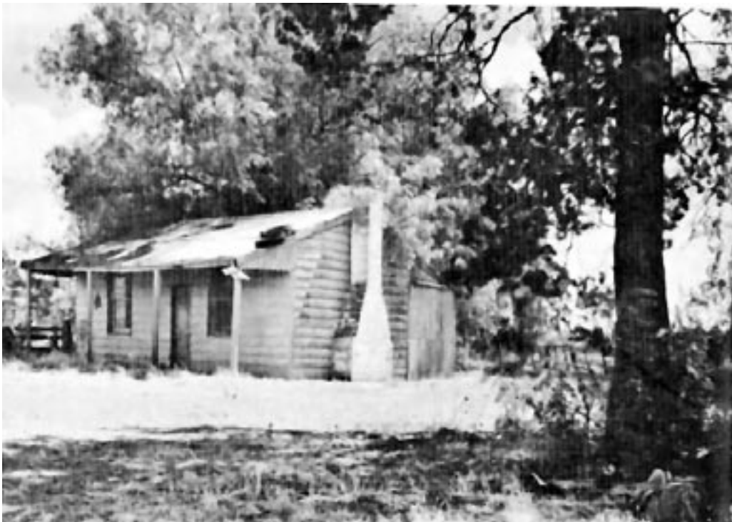
One of the few houses remaining in the early 1970's.