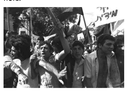
The Israeli Black Panthers (pictured) were disadvantaged Mizrahi Jews protesting the Israeli State's actions.

history. The present Israeli government more commonly refers to Israel as The Jewish State. Divergent and critical opinions, while still possible, are increasingly threatened. the ln OPT. settlements grow apace; the stranglehold by Israel from the outside, and the repression of Gaza from within, by Hamas, has impoverished and disempowered the population to the point of near starvation and desperation. All movement towards an independent Palestinian State is on hold.