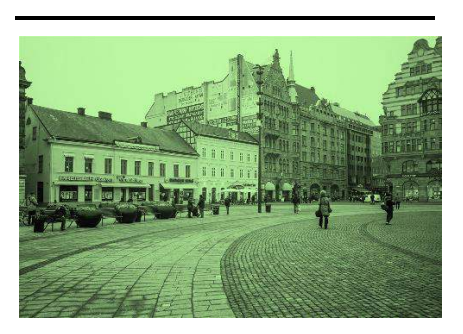
Being Jewish in 'Swedistan'

Despite the challenges and complexity of the situation of antisemitism in the Palestine solidarity movement, let us not shrink from exposing and confronting it. Let us do this appropriately, constructively, but let us not harbour it.