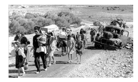
The Palestinian exodus from the newly declared Jewish State, 1948.