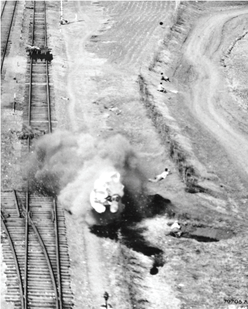
Figure 4. Railroad Interdiction by USAF showing North Korean Laborers, 1951.