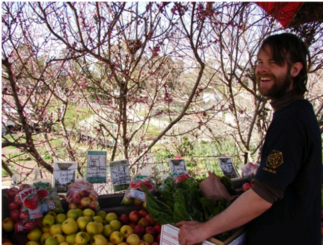
CERES Organic Market