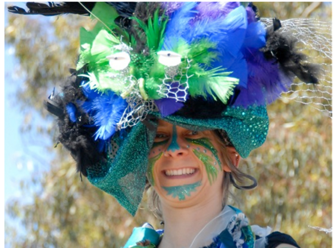
Return of the Sacred Kingfisher Festival, celebrated each year in Spring at CERES.