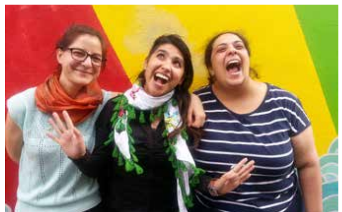
Programmers from 3CR's national program, Accent of Women