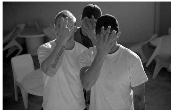
during the Beyond the Bars broadcast

For the past 39 years, 3CR has provided an invaluable forum for hundreds of community groups to promote their activities via community service announcements. This continued in 2013 with the station producing and broadcasting around 65 individual announcements from over 50 community groups, as well as contra announcements and bulk bookings through Spots and Space, 4PeopleMedia, LEBA, and Yarra News.