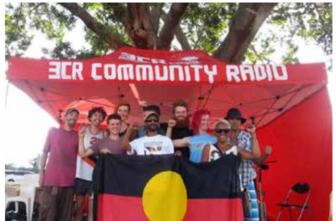
3CR broadcasters during the Brisbane G20 protests

See http://www.3cr.org.au/nationalprograms