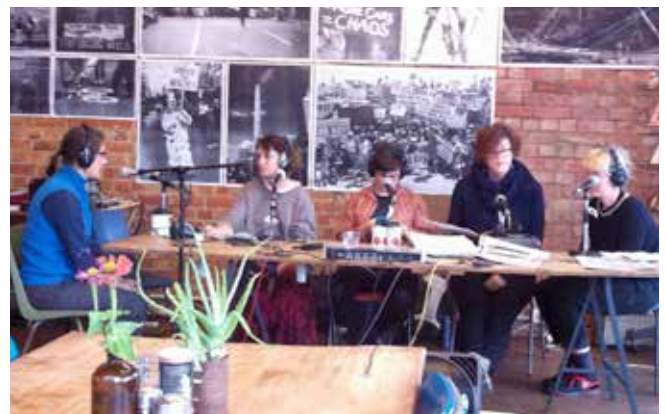
3CR programmers during the Sustainable Breakfast series broadcasts live from Friends of the Earth