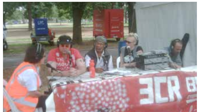
The Roominations team broadcasting live from the Where the Heart Is festival