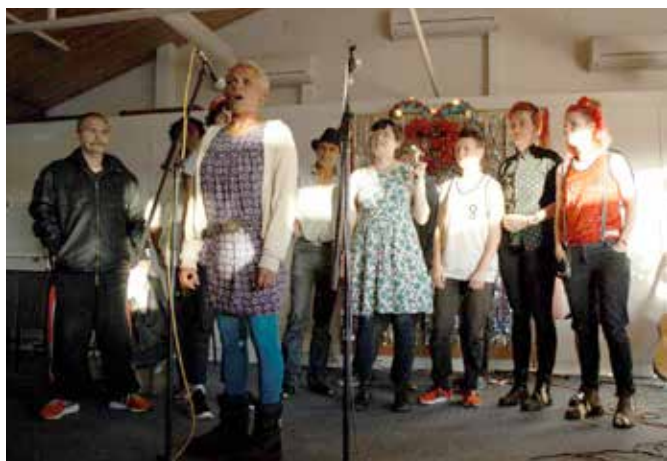
3CR programmers accepting the award for Best Outdoor Broadcast for their live coverage of the Brisbane G20 protest

As in previous years, most new volunteers in 2014 went on to join existing programs with specifically selected volunteers joining breakfast programming. A handful of new volunteers successfully proposed new programs that went to air in 2014.