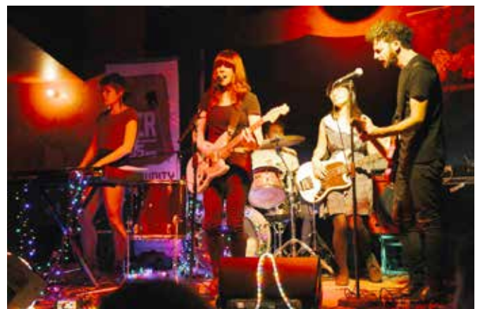
Women of Rock, 3CR's live broadcast for International Womens Day