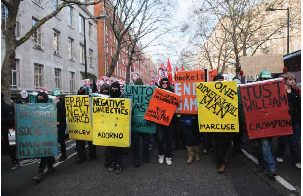
ABOVE: STUDENTS IN THE UK 'BOOK BLOC' PROTEST EDUCATION CUTS