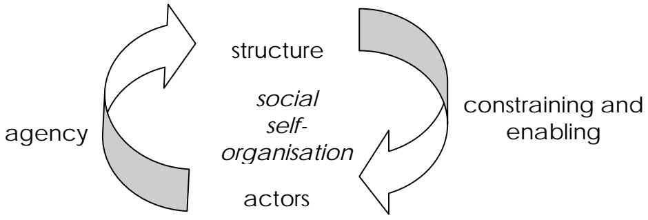
Fig. 1.: Self-organisation in social systems

forecasted by taking a look at the elements, their history and their actual interactions. Social structures constrain and enable the practice of social actors, "guiding" them in this way. This is a process of top-down emergence where new properties of actors and groups can emerge. The bottom-up- and the top-down-process together form a cycle that permanently results in emergence on the level of structures and the level of actors. This is a permanent, dynamic creative process<sup>6</sup> (see fig. 1).