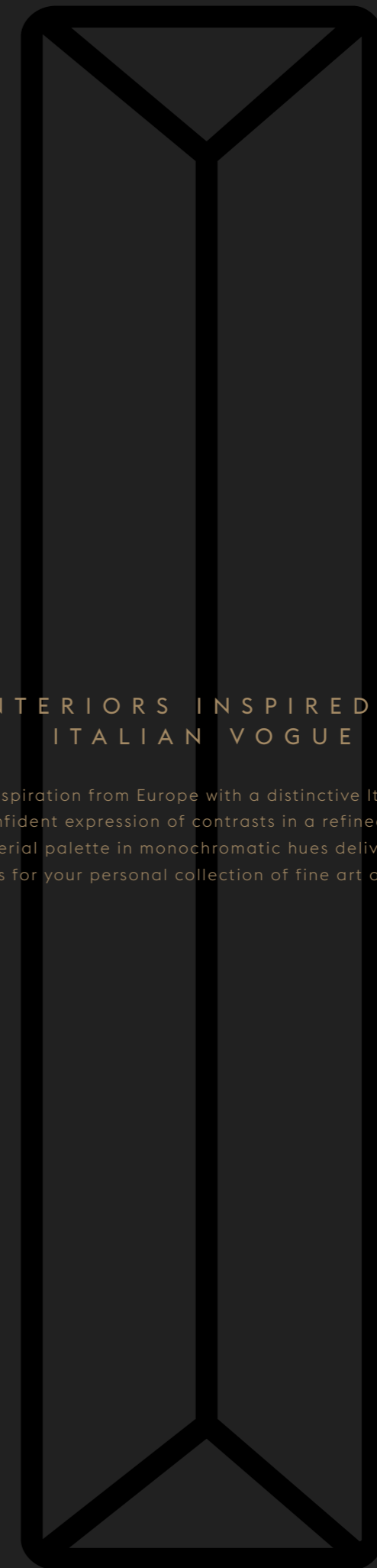
A bold and refined palette by Carr Design

Drawing inspiration from Europe with a distinctive Italian flavour, Adderley is a confident expression of contrasts in a refined industrial context. A natural material palette in monochromatic hues delivers sophisticated backdrops for your personal collection of fine art and furniture.