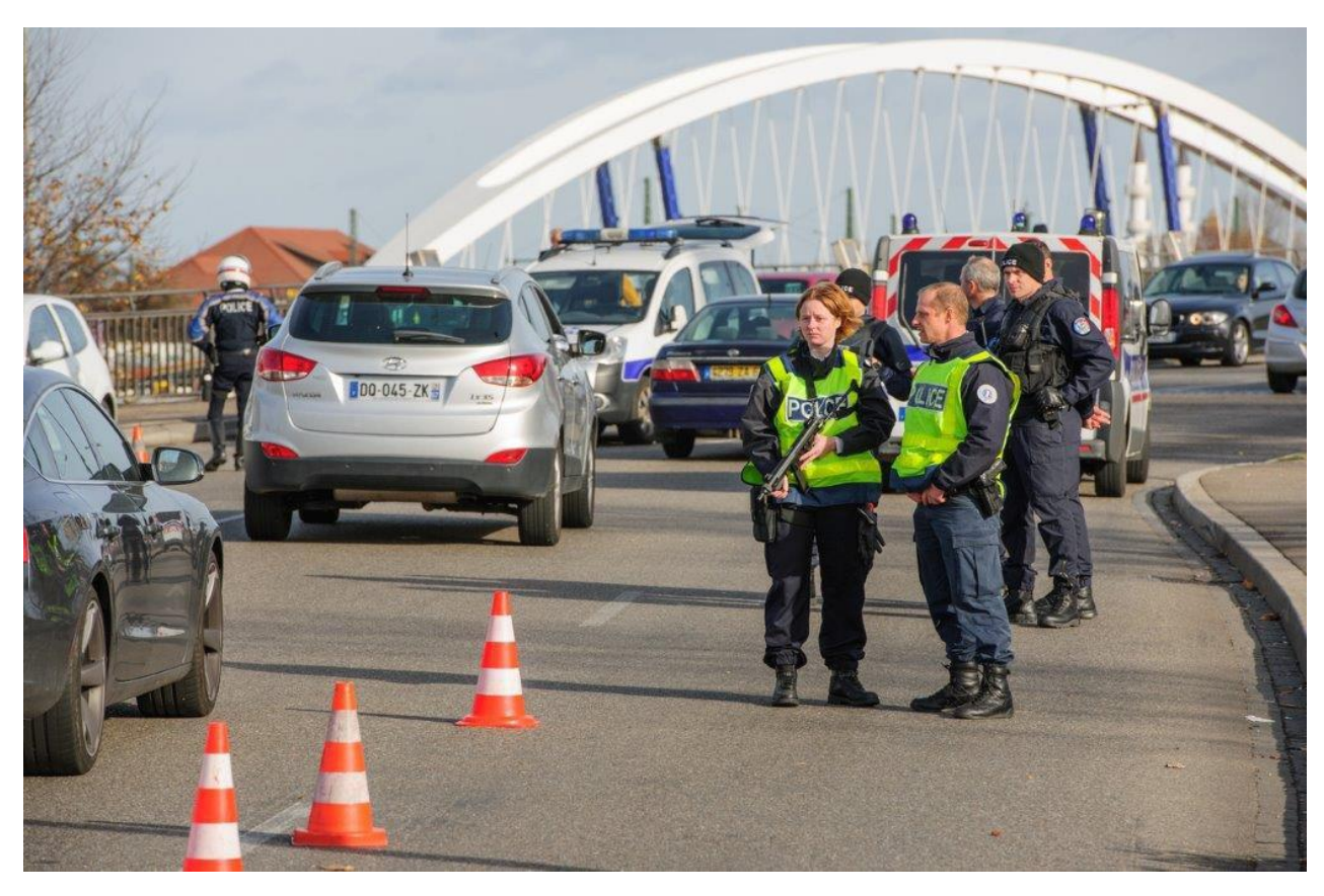
Figure 1 Strasbourg, France - November 14, 2015: French Police checking vehicles on the 'Bridge of Europe' between Strasbourg and Kehl, Germany, as a security measure in the wake of attacks in Paris.