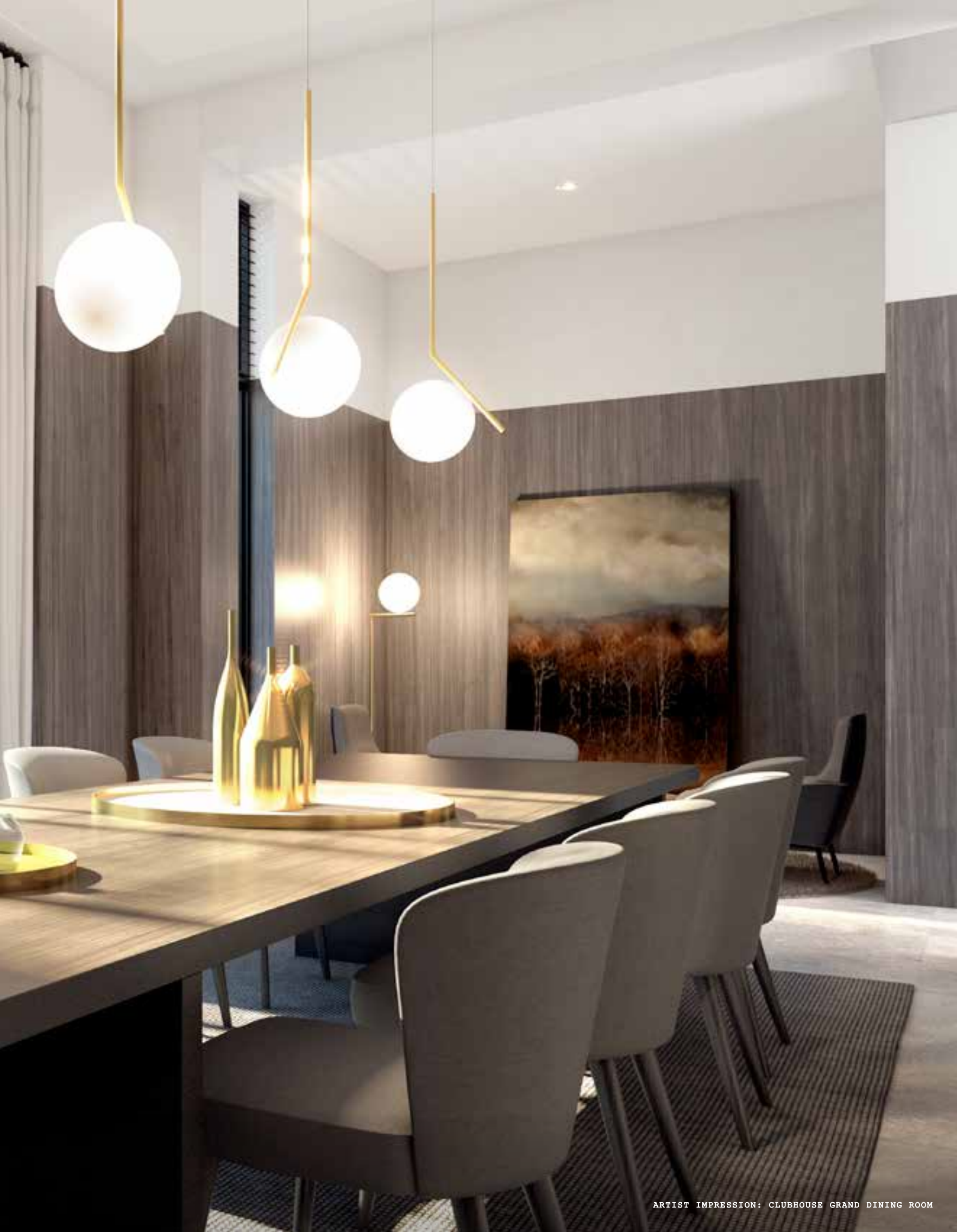
ARTIST IMPRESSION: CLUBHOUSE GRAND DINING ROOM