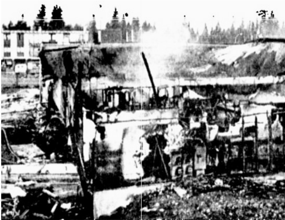
Surrey, B.C. video store lies in ruins follo