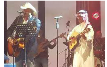
Top: Donald Trumps bows to the Saudi King. Left: Ted Nugent. Right: Toby Keith playing boys-only Saudi gig in support of Trump visit.