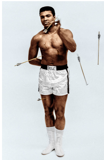
Muhammad Ali

Trump's political career might have just started, but he joins a long line of chicken hawk lawmakers who push war, while being rich enough to avoid it for themselves.