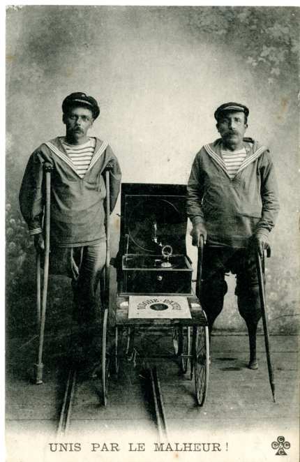
“UNIS PAR LE MALHEUR!” postcard with photograph of two disabled French Marines and Pathe phonograph, circa 1914-18