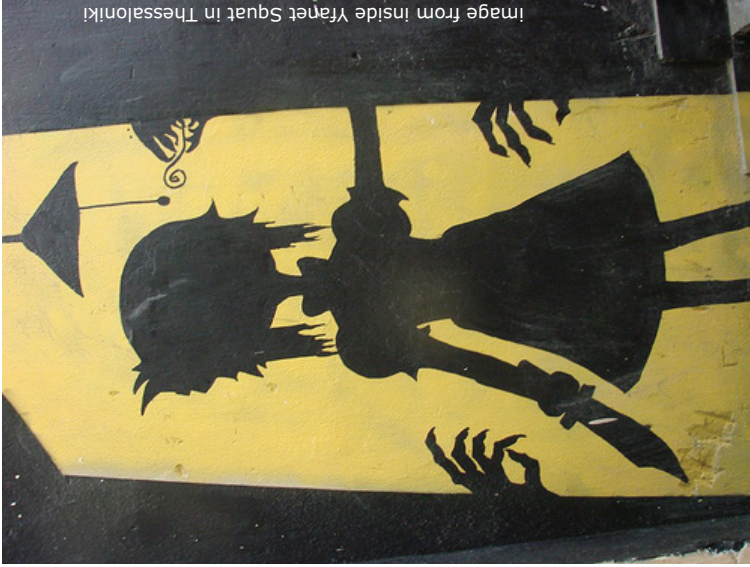
Image from inside Yfaret Squat in Thessaloniki

Organise! aims to be an organisation of revolutionary class struggle anarchists who share political positions, articulated in theory, strategy and tactics. We exist to keep alive a revolutionary critique of capitalism, to assist in working class struggles, to attack all authoritarian ideologies such as racism and sexism, and to encourage and help build working class unity and militancy. For a copy of aims & principles', to get in contact, to critique or just to say hi, contact the email in our beautiful letterhead.