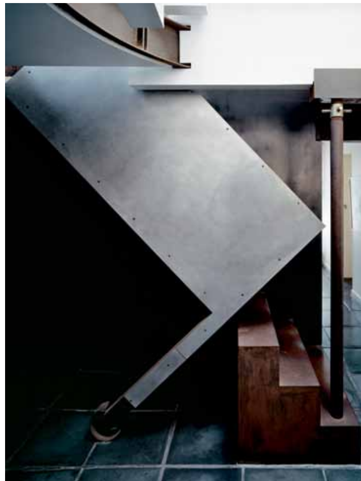
Right: Morphosis Architects, Sixth Street Residence, 1992, Santa Monica, CA. Interior.

As Thom Mayne's or Eric Owen Moss's buildings incorporated industrial spaces and artifacts, they also transformed our understanding of postwar industry into something considerably more unstable and menacing.