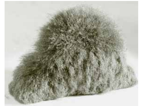
Above: New-Territories/R&S(n), Dustyrelief/B_mu , 2002, Bangkok. Material study.