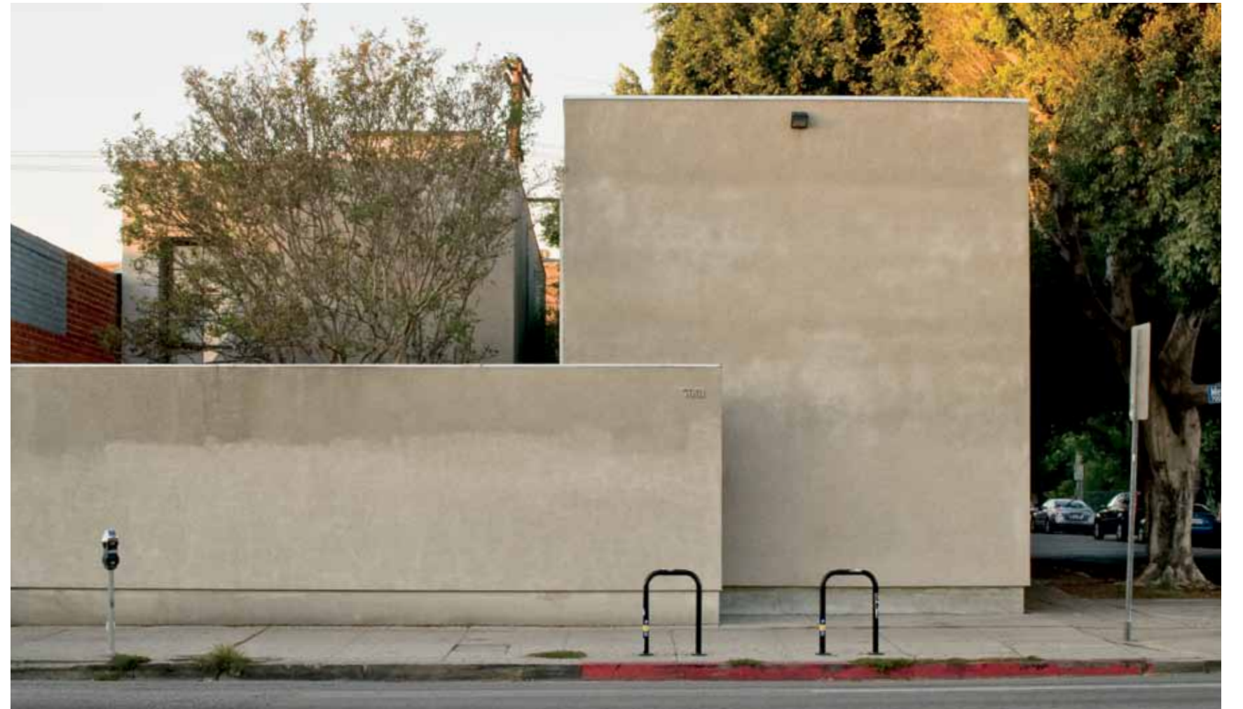
Opposite page: Eric Owen Moss Architects, Beehive, 2001, Culver City, CA.