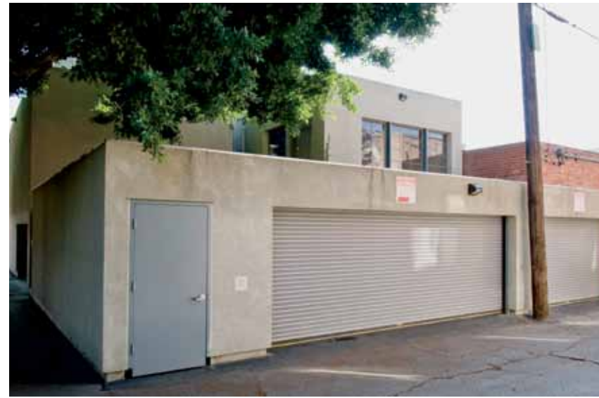
Frank Gehry, Danziger Studio and Residence, 1965, Hollywood, CA.

Subnature is both biological matter and technological material, nature and industry, organic dirt and synthetic seepage.