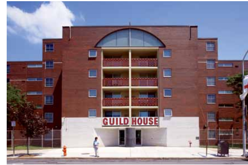
Left: Venturi and Rauch, Guild House, 1963, Philadelphia. Shown after Venturi, Scott Brown and Associates’ 2009 rehabilitation.

THE DANZIGER STUDIO became a key work in two legendary spatial and environmental analyses of LA: Banham’s Architecture of Four Ecologies (1971) and Davis’s City of Quartz (1990). Within these histories, Gehry’s project functions as a barometer of geographical reconfigurations afoot in contemporary LA, yet each narrative voiced a markedly different interpretation of its stucco face. Banham focused on