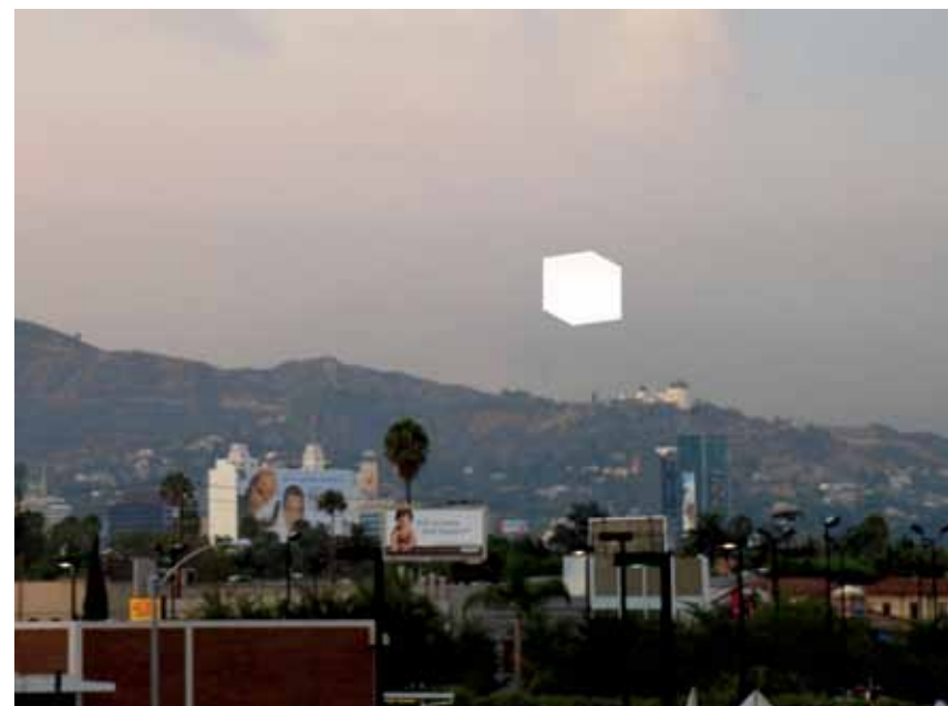
Left: Pelli Clarke Pelli Architects, 777 Tower, 1990, Los Angeles.