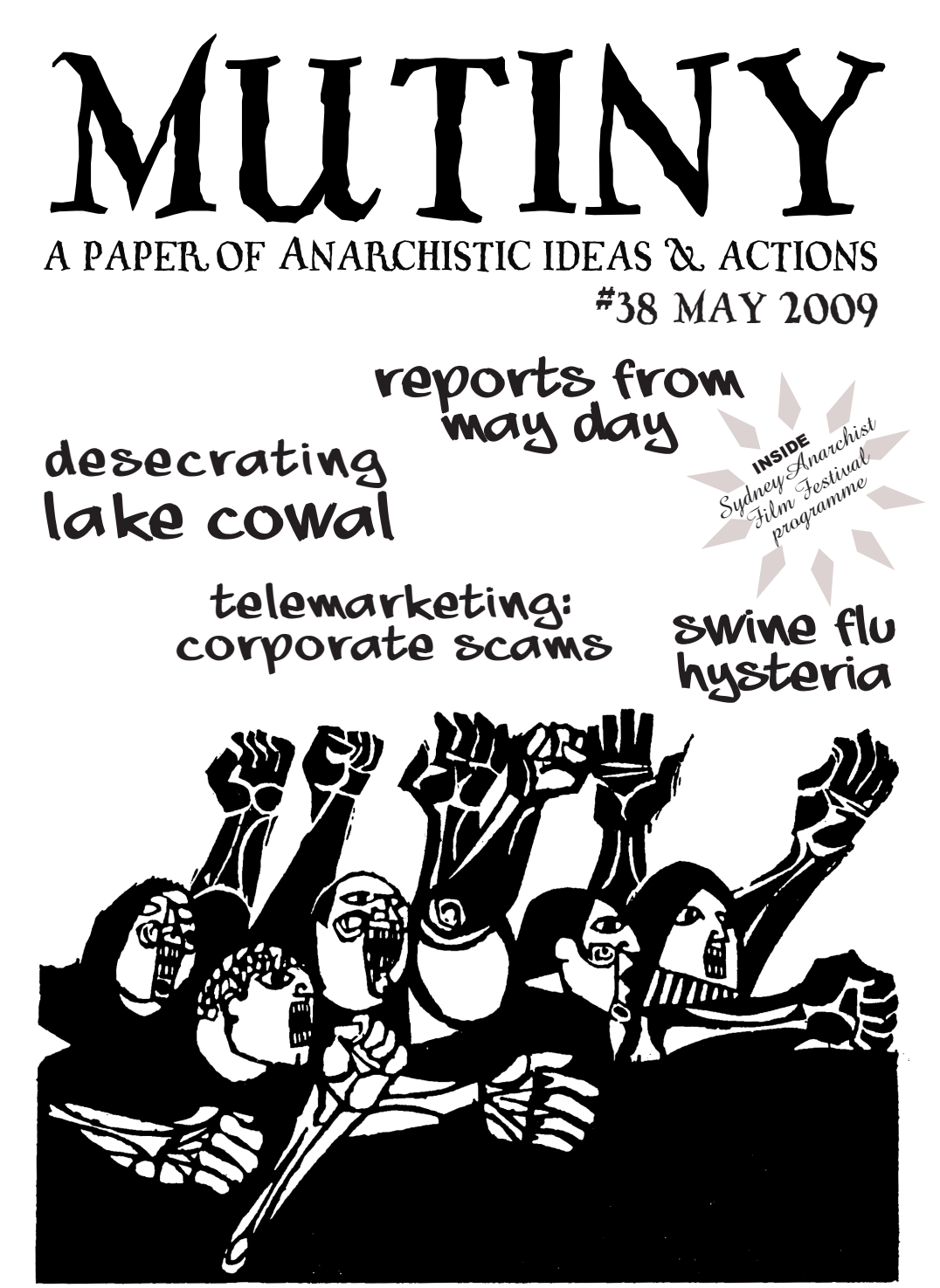
If the government doesn't stop the war, We will stop the government.

15 Minute of Fame by M. Skelton Book launch Melbourne City Library reading room http://www.emergingwritersfestival.org.au/