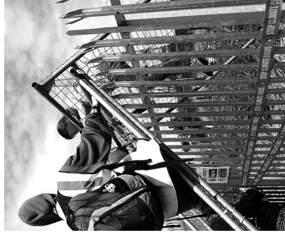
Protesters using one fence to scale a second fence at the power station

Police said they had arrested 100 protesters & charged 46. A spokesman for EON said the protesters had not affected its power output. There was debate within the movement & opposition raised by mining unions over the camp's focus on opposition to coal.