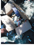
plumbing equipment used to reconnect the water