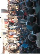
assembly at the patras refugee camp