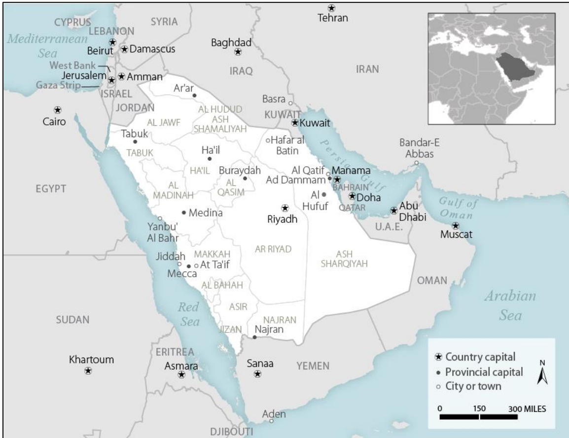
Table I. Saudi Arabia Map and Country Data

Land: Area, 2.15 million sq. km. (more than 20% the size of the United States); Boundaries, 4,431 km (~40% more than U.S.-Mexico border); Coastline, 2,640 km (more than 25% longer than U.S. west coast)