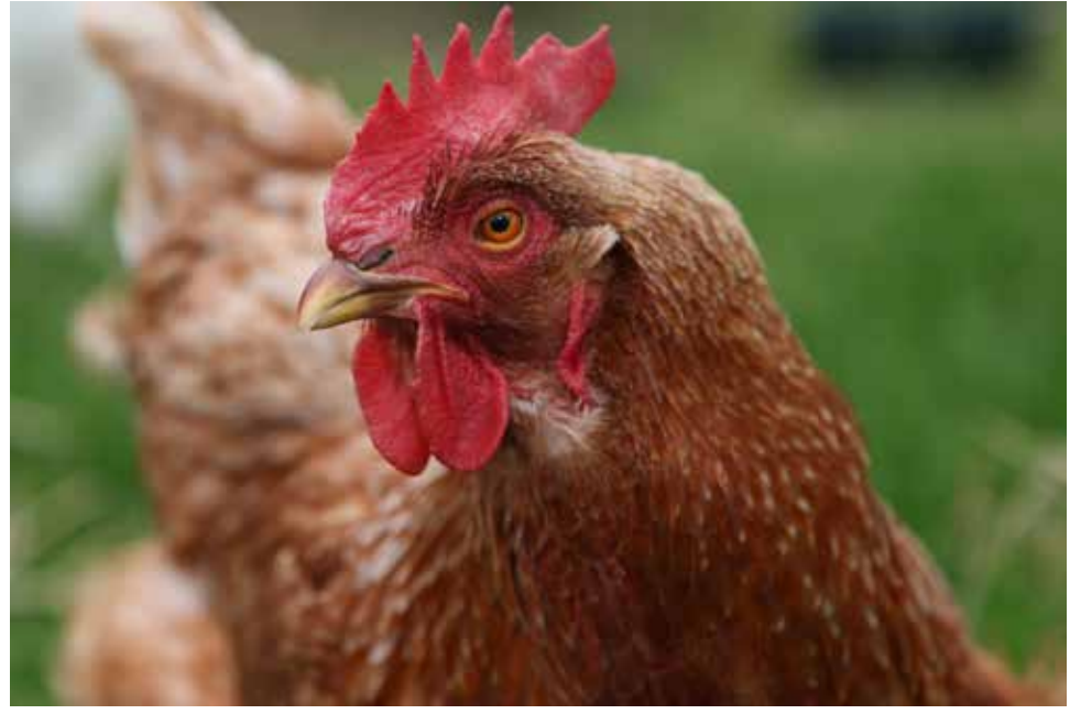
Brooks chicken looking very smug with her own intelligence

Self-awareness describes an animal's understanding of who she is to herself: that is, her sense of herself as an "I" independent from others. Often associated with a range of complex psychological capacities that include phenomenal consciousness (what it feels like to have an experience), selfconsciousness (awareness of oneself as an individual), metacognition (the ability to think about one's own thoughts), and autonoetic consciousness (the ability to mentally orient oneself in the past, present, and future), selfawareness is not a cognitive feature that should be understood as simply available or unavailable. Instead, self-awareness is a concept best defined as a continuum.<sup>51</sup>