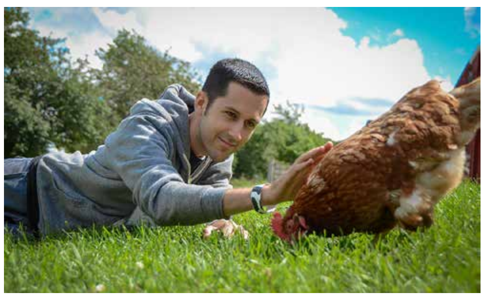
A visitor to Farm Sanctuary interacts with Penelope chicken

These conclusions only scratch the surface of who domestic chickens are: family members, group leaders, mothers, fathers, children, and, most of all, particular individuals who each maintain habits, preferences, and complex social relationships. The available research on chickens is quite suggestive. Even so, a fuller understanding of these fascinating creatures requires much more respectful, non-invasive study in naturalistic settings that allow chickens to express themselves and, in so doing, help us learn more about who they are. Therefore, inspired by what we do know about chickens, we hope for a future full of human-chicken relationships curious about and celebratory of what both species may share in common.