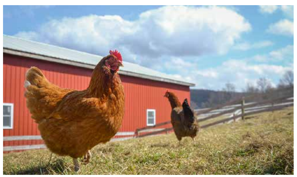
Chickens use their emotions to make decisions on what kinds of environments they prefer

take into account the positive and negative emotions these feeling animals experience.<sup>89</sup> Further, by exploring animals' emotions, we illuminate another major facet of psychology that nonhumans share with humans.<sup>90</sup> Indeed, studies that demonstrate the emotional lives of animals abound: with regards to birds in particular, for example, sparrows react emotionally to the songs of their fellows,<sup>91</sup> European starlings experience mood shifts,<sup>92</sup> and quail show fear.<sup>93</sup> All of these studies provide evidence of not only negative emotions in birds, but positive emotions as well.