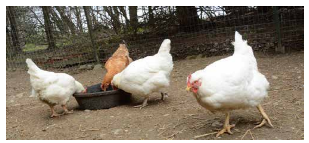
Hens like Thumbelina gain information by watching other hens interact

defeat a stranger confronted the stranger half of the time, showing that they understood they had some chance of emerging as the more dominant hen. Finally, in the third situation, the proportion of times hens first approached the stranger matched whether they saw the stranger lose during her confrontation with the dominant hen or not. Taken together, these results show the complex logical reasoning required for one of hens' most fundamental and basic forms of social organization.