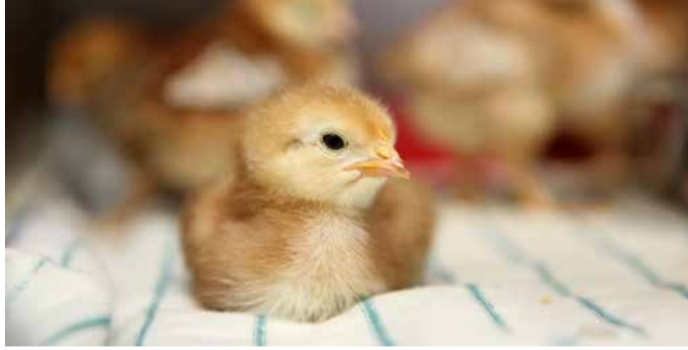
Chickens can use their past experiences to anticipate the future

touch screen would be rewarded after six minutes. After seeing the visual signal and waiting for about six minutes, hens pecked at the screen more frequently, showing that they could estimate the time required to get their reward.<sup>35</sup> In another study, hens learned to associate three sounds with either food (a good outcome), a squirt from a water gun (a bad outcome), or nothing (a neutral outcome); these outcomes arrived 15 seconds after the sound. Hens showed different emotional responses to the sounds, demonstrating that they anticipated either a positive, negative, or neutral outcome based on their understanding of what the sounds foretold.<sup>36</sup> In short, chickens can not only estimate time intervals, but also use their past experiences to anticipate the future.