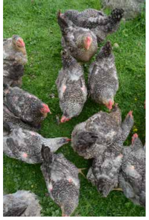
Bawking chickens

Bawk, bawk, bawk; cluck, cluck, cluck: chickens may be well-known for how their communication sounds when it falls on human ears, yet the ways chickens transfer information from one individual to another is far more complex than what we might hear on first listen. A critical component of social complexity, ample evidence exists that animal commu-