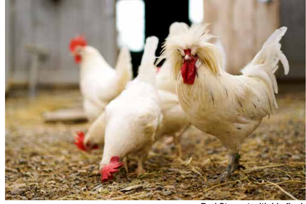
Rod Stewart with his flock

For both jungle fowl and wild or free-ranging domestic chickens, social groups are comprised of one dominant male, one dominant female, lower-ranking chickens of both sexes, and chicks. Group members live on a home range during their breeding season; within that range, they have regular roosting sites that include the lofty branches of trees.<sup>7</sup> From berries and seeds, insects and small vertebrates, chickens eat a varied diet.<sup>8</sup>