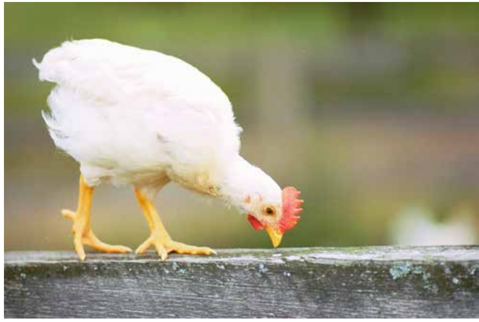
Mayfly chicken scratching

One of the chicken's most important sensory organs is her beak. Equipped with numerous nerve endings and a highly specialized, sensitive tip, the beak enables chickens to make precise distinctions between the objects they touch.<sup>9</sup> Chickens also use their beaks to grasp and manipulate objects when eating, nesting, exploring, drinking, and preening. They even use their beaks as weapons when establishing their place in the social hierarchy and when defending themselves. Because of the beak's incredible sensitivity, damage to it causes her intense pain.<sup>10</sup> In addition to their beaks, chickens are sensitive to touch, and their skin detects temperature, pressure, and pain thanks to numerous sensory receptors.