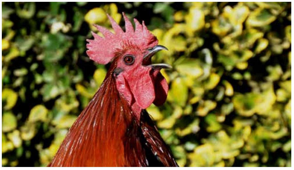
Boyd chicken is getting his point across

The variability of chickens' alarm calls becomes even more complex when taking into account roosters' attention to "audience effects," or the changes they make to how they communicate based on who is listening. For example, when a hen is present, a rooster is more likely to sound the alarm indicating an aerial predator, a calculation that increases the likelihood that his mate and children will survive the threat.<sup>65</sup> Roosters also communicate in ways that simultaneously warn fellow chickens of danger and confuse predators who might be listening. Roosters are more likely to sound an alarm if a lower-ranking chicken is nearby, effectively giving the predator an additional target and increasing the signaling male's chance of survival.<sup>66</sup> When hiding under a tree or a bush, roosters take into account what aerial predators can see: roosters give alarm calls that are longer in duration (and easier for predators to follow) when they are hidden under cover than when they are exposed.<sup>67</sup>