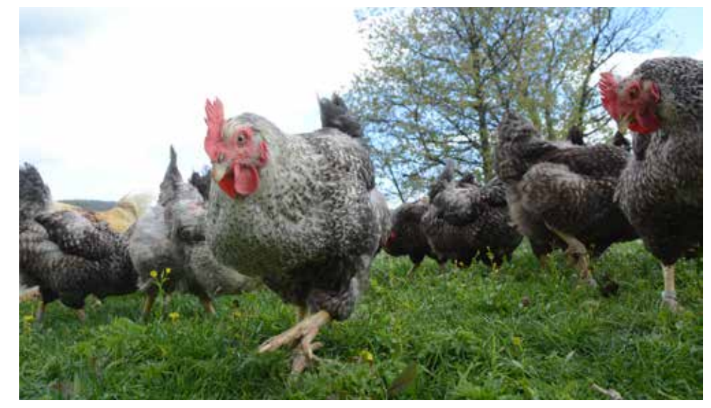
Chickens watch each other for social cues