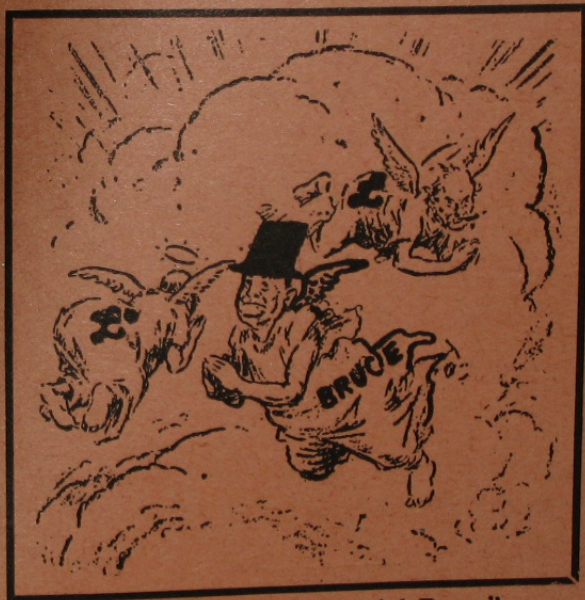
The Angels of "Industrial Peace"