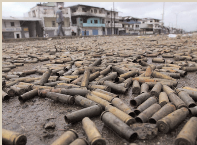
Shell game: If Bout were gone, other traffickers would pick up the pieces.

He is only one of the many arms traffickers who would try to pick up where Bout left off. Dozens more are waiting in the wings. But none will have the clout or reach of Viktor Bout. “On their best days, [other arms dealers] couldn't influence a war either way. They were peanuts,” says one U.S. official who asked not to be identified because of ongoing investigations of Bout. “Bout could make or break a country.” It may be some time before we see the likes of him again. —DF