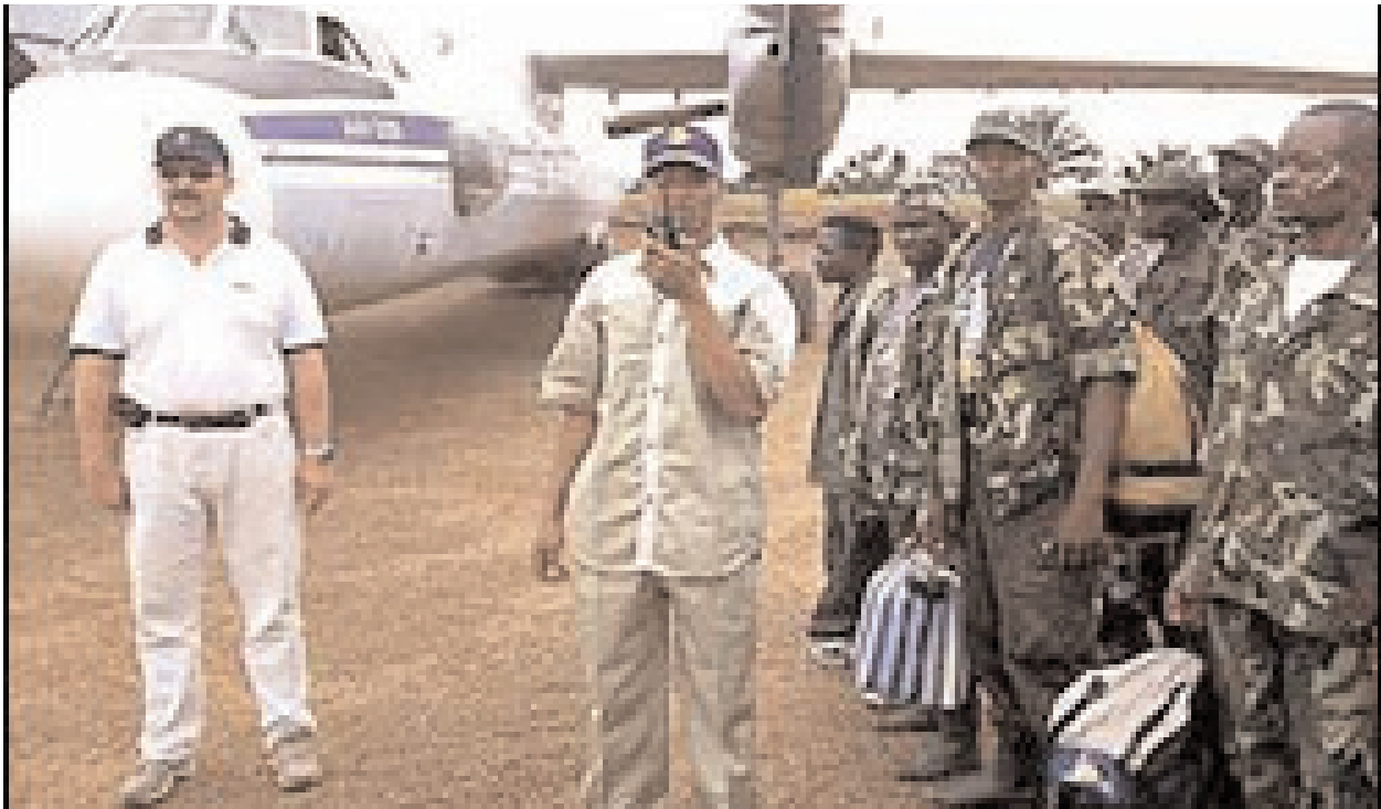
Up in arms: One of the only known photographs of Viktor Bout, left, was taken with a zoom lens in central Africa.

Whether or not he was a secret agent, by the time the Cold War ended, Bout had struck out on his own and was ready to salvage the remaining scraps of the Soviet empire. The entire Soviet Air Force was on life support, as money for maintenance and fuel evaporated. Thousands of pilots and crew members were suddenly unemployed. Hundreds of lumbering old Antonov and Ilyushin cargo planes sat abandoned at airports and military bases from St. Petersburg to Vladivostok, their tires frayed and their worn frames patched with sheet metal and duct tape.