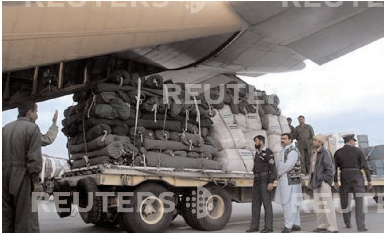
A force for good and evil: Relief supplies for tsunami survivors are loaded onto one of Bout’s planes in Pakistan.

In the meantime, Bout lives in a luxury apartment complex in Moscow, where he is occasionally spotted eating out at fancy sushi bars. Richard Chichakli, Bout’s American business partner, also moved to Russia, using frequent flier miles to buy a ticket out of Texas after his assets were frozen in April 2005 by U.S. officials, who suspected he was running some of Bout’s businesses from the United States. In