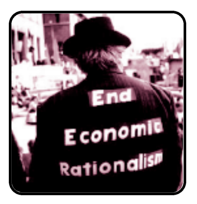
The revolution will be reflected upon: thoughts on J18.