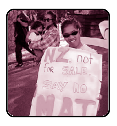
Peoples' Global Action? A brief history.