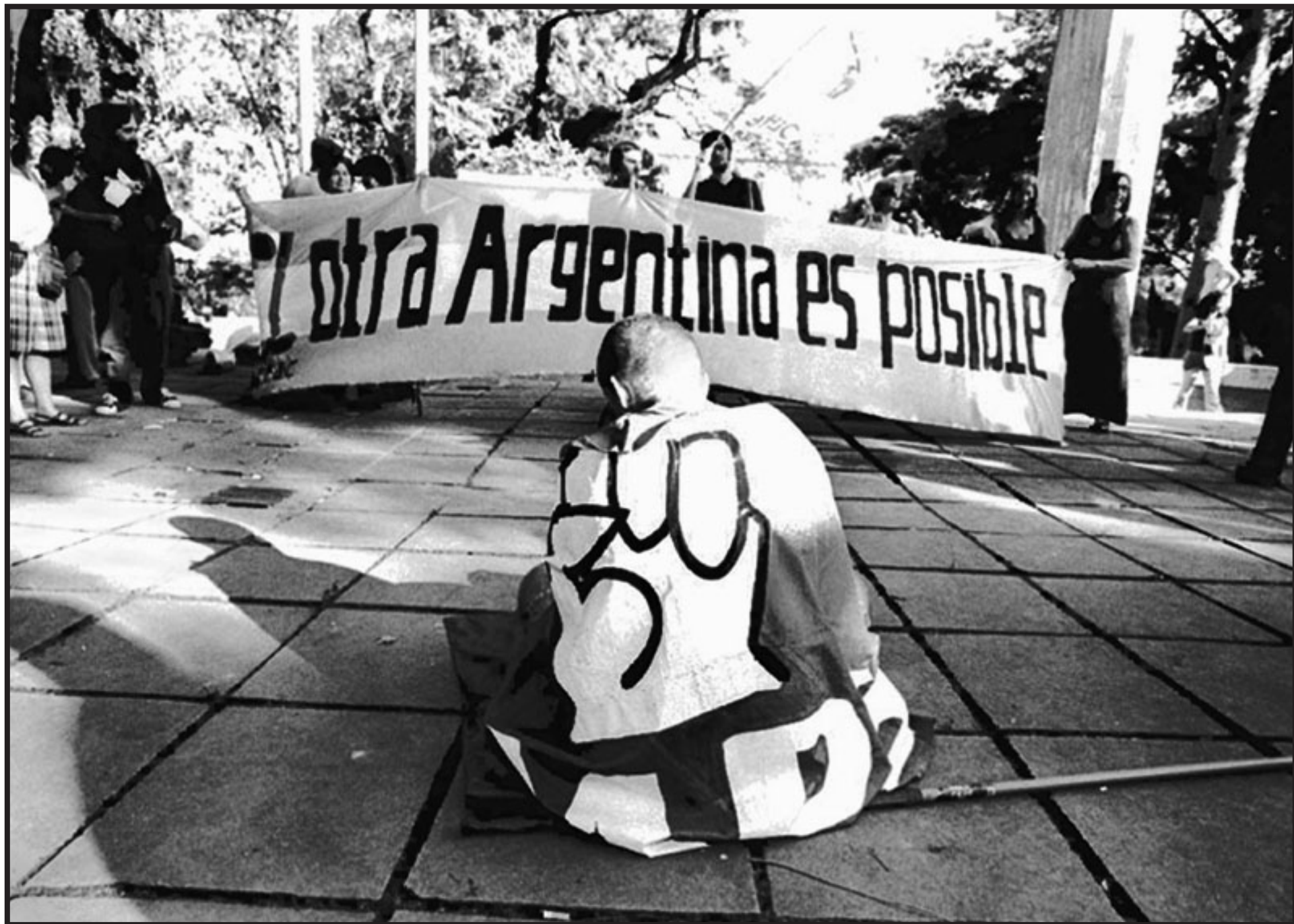
Argentinian solidarity demo at the World Social Forum in Porto Alegre, Brazil, February, 2002.