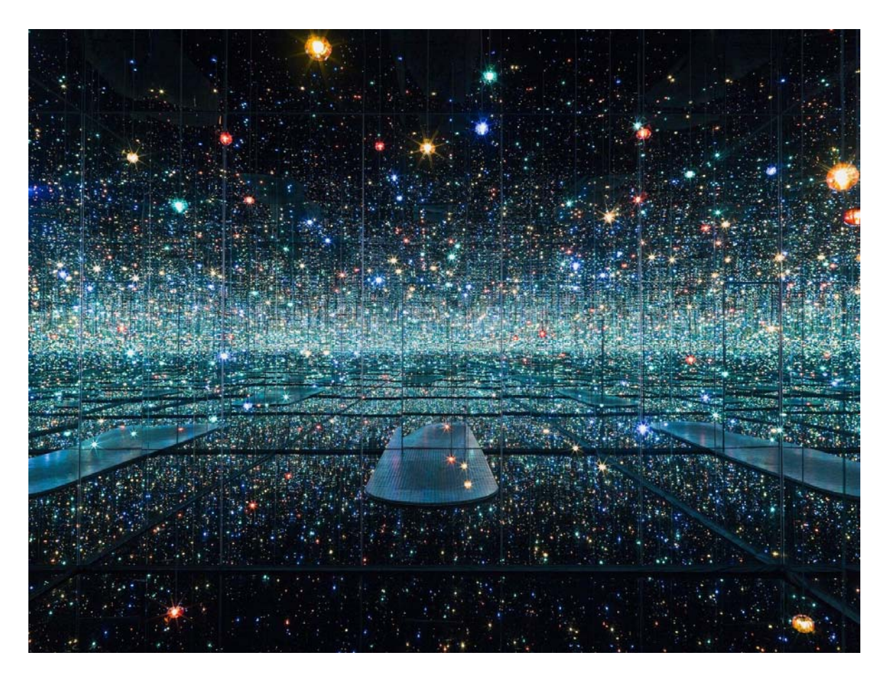
Yayoi Kusama, Infinity Mirrored Room – The Souls of Millions of Light Years Away, 2013. Wood, metal, plastic, acrylic panel, rubber, LED lighting system, acrylic balls, and water. 113 \frac{1}{4} x 163 \frac{1}{2} x 163 \frac{1}{2} in. Courtesy of David Zwirner, N.Y. © Yayoi Kusama.