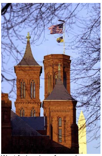
West-facing view of an early morning sunrise at the Smithsonian Institution Building ("The Castle").

The Smithsonian is the steward of an extensive collection. The total number of artifacts, works of art, and specimens in the Smithsonian's collections is estimated at 156 million, of which 145 million are scientific specimens at the National Museum of Natural History. The collections form the basis of world-renowned research, exhibitions, and public programs in the arts, culture, history, and the sciences. The Smithsonian Affiliations program brings its collections, scholarship, and exhibitions to 46 states, Puerto Rico, and Panama.