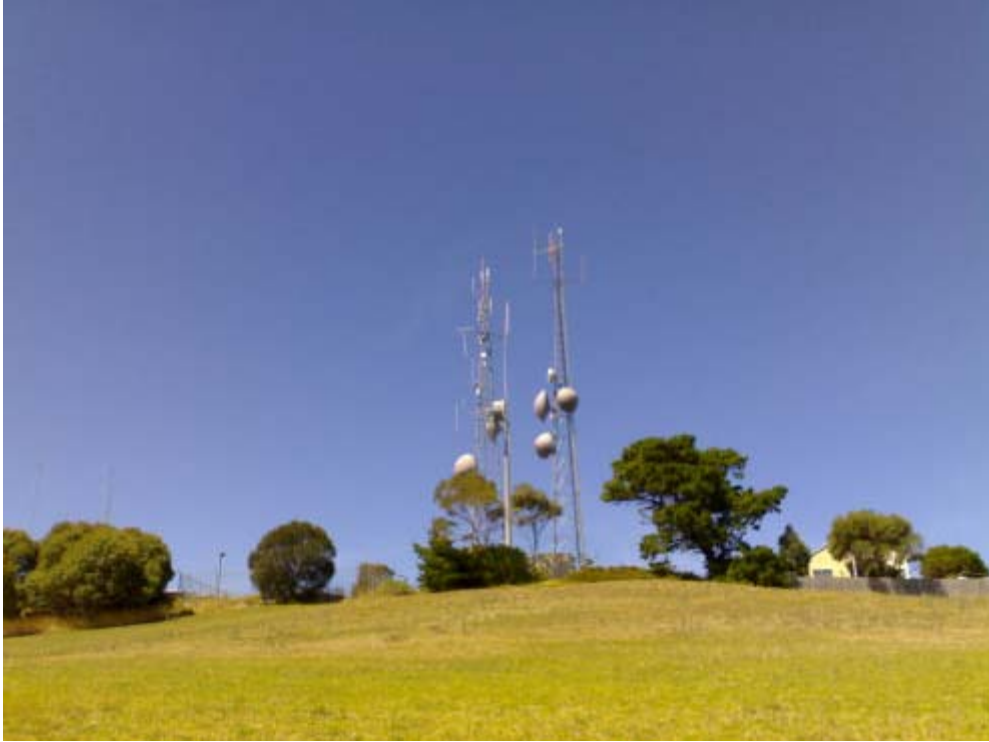
Seal Inc site at 71 Hyland St.

1: Onsite install only. No travel costs included.