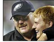
Family in crisis