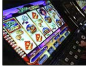
A.C. rides Asian tide