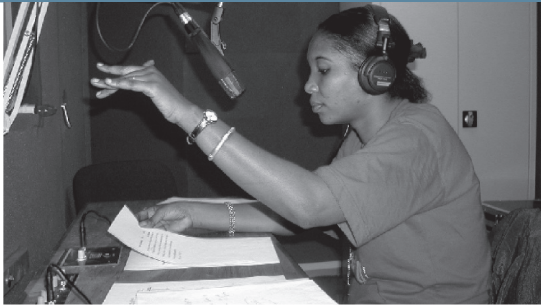
Newsreader in the DRC