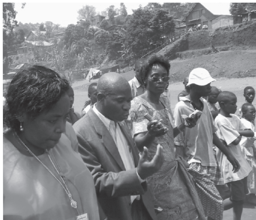
Local journalists reporting in Goma

Another line of discussion concentrated on the public broadcaster model, noting that it does offer an alternative to state regulated controls on press freedoms, if it can be adequately regulated. One participant noted that where the legal system is inadequate, it might be done internationally. An example of this was given from the Democratic Republic of Congo. However, this approach raised concerns about state sovereignty. It was felt that the only organisation that might at some point be able to take on such a role on a permanent basis is the United Nations. There was a consensus that such a development would be positive, but was currently unlikely.