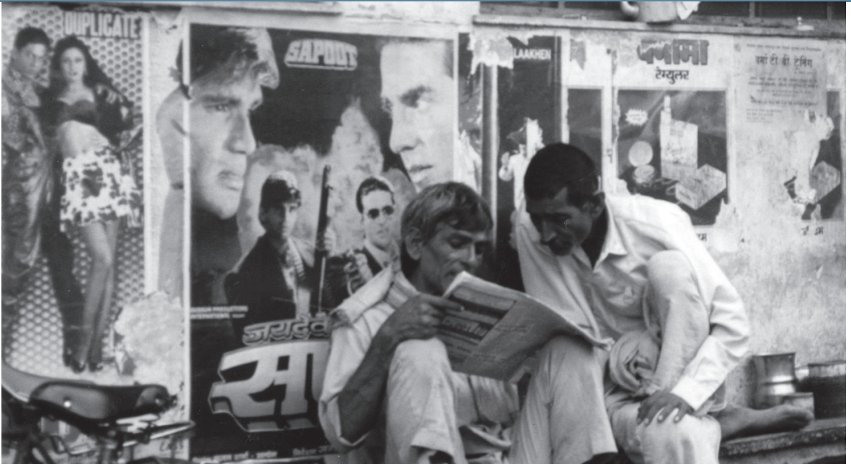
Indian men sharing a newspaper in Mumbai