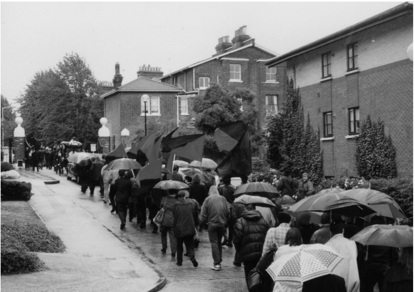
Inside: Anarchist Archives and Libraries