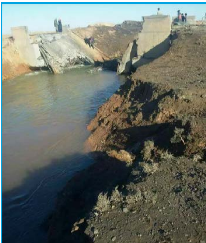
Al Mazra'a bridge after an aerial attack by international coalition forces – Sunday, January 29, 2017

Sunday, January 29, 2017, fixed-wing international coalition forces warplanes fired a number of missiles at the bridge that connects the villages of al Tabaqa county with the rest of the villages of western suburbs of Raqqa governorate (the bridge is located in Mazra'at al Ansar village in western suburbs of Raqqa governorate). The bridge was destroyed completely and was rendered out of commission. The village is currently under the control of SDF, whereas it was under the control of ISIS at the time of the incident.