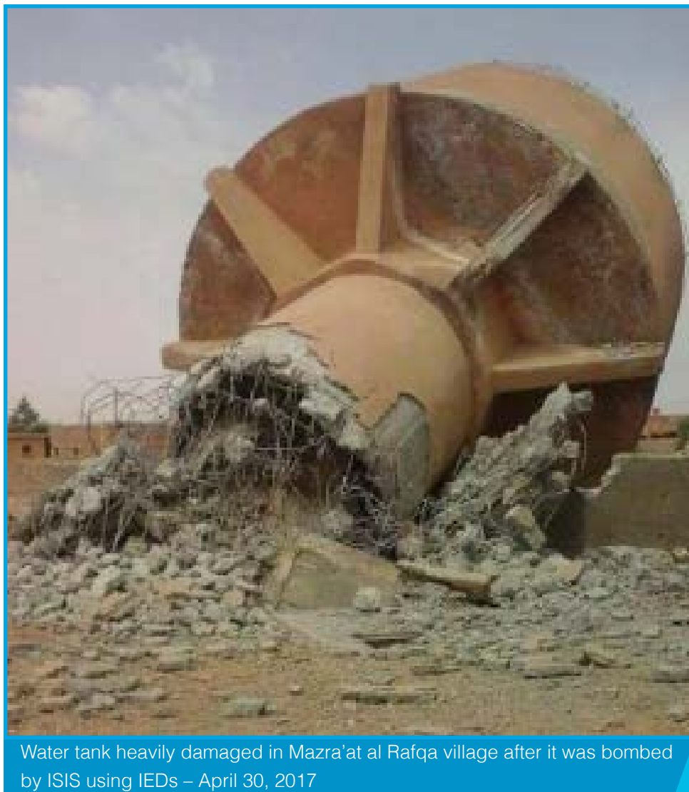
Water tank heavily damaged in Mazra'at al Rafqa village after it was bombed by ISIS using IEDs – April 30, 2017

Sunday, April 30, 2017, ISIS used IEDs to bomb the high water tank in Mazra'at al Rafqa village , northwestern suburbs of Raqqa governorate. The tank was destroyed completely and was rendered out of commission, as the water was cut off completely in the village. The village is currently under the control of SDF, whereas it was under the control of ISIS at the time of the incident.