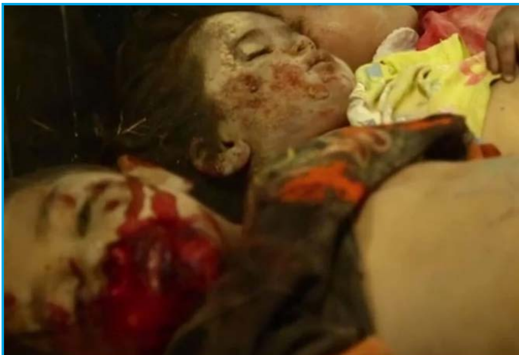
Children victims who were killed in an airstrike by international coalition forces in Shneina village – May 12, 2017

Friday, May 12, 2017, fixed-wing international coalition forces warplanes fired a number of missiles at Shneina village , northern suburbs of Raqqa governorate, which resulted in the killing of seven children at once. The village is currently under the control of SDF, whereas it was under the control of ISIS at the time of the incident.