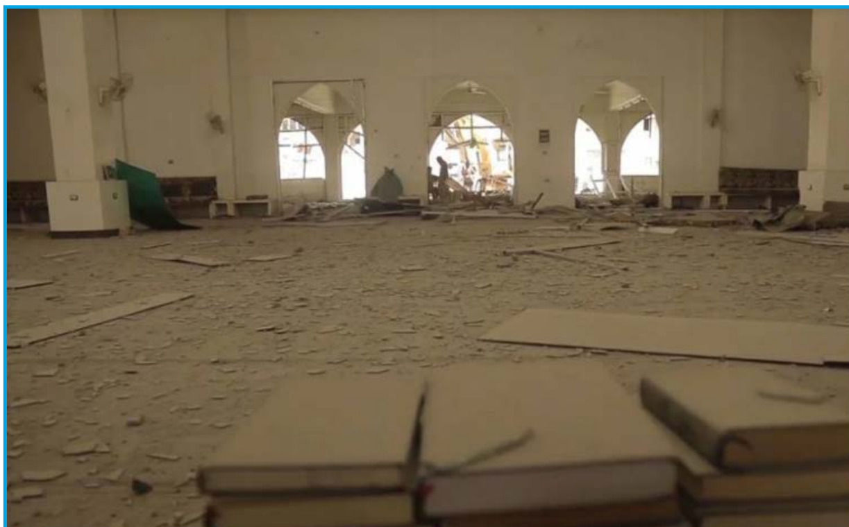
Picture from inside the al Ulo Mosque, west of Raqqa city, showing the damages after an airstrike by international coalition forces – May 27, 2017

Saturday, May 27, 2017, fixed-wing international coalition forces warplanes fired a number of missiles near al Ulo Mosque in al Haramiya District, southeastern Raqqa city. The mosque building and its furniture were heavily damaged . The city was under the control of ISIS at the time of the incident.