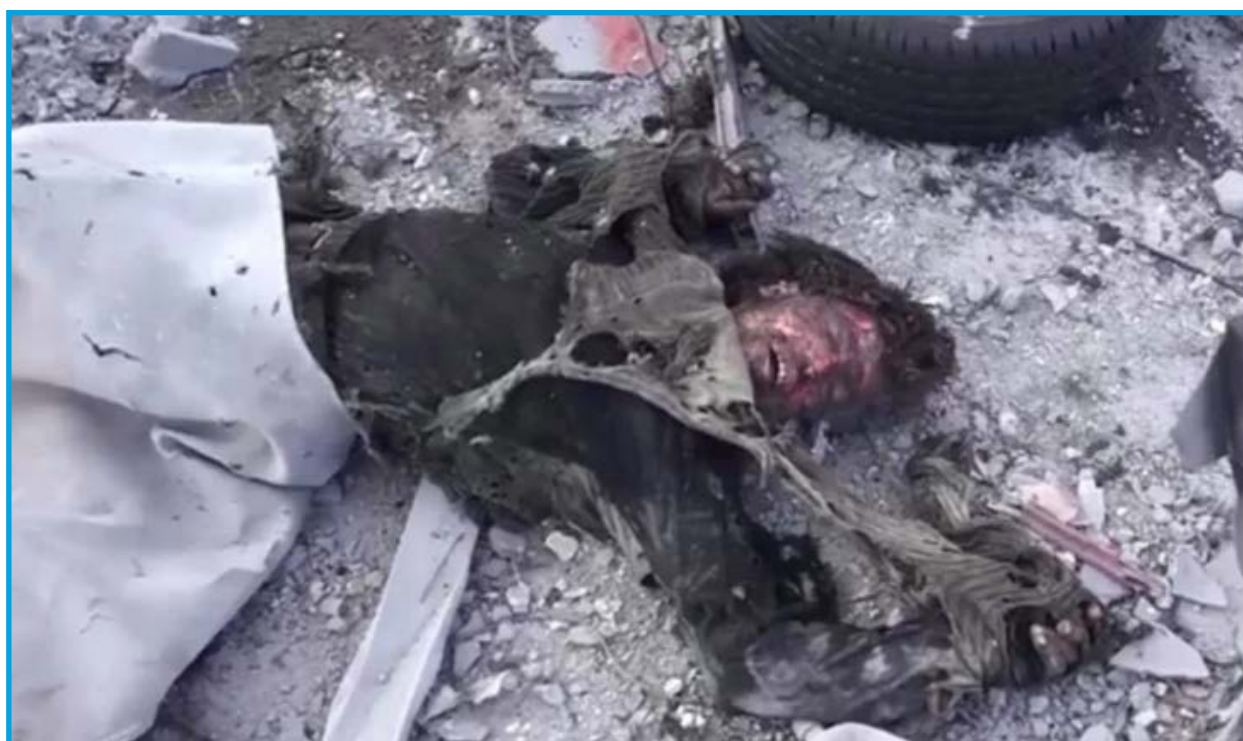
A civilian who was killed in an aerial attack by international coalition forces on a car wash in al Tabaqa city – March 21, 2017

Tuesday, March 21, 2017, fixed-wing international coalition forces warplanes fired a number of missiles at al Manara Car Wash in al Tabaqa city, western suburbs of Raqqa governorate , which resulted in the killing of six civilians at once, including one child. The city is currently under the control of SDF, whereas it was under the control of ISIS at the time of the incident.