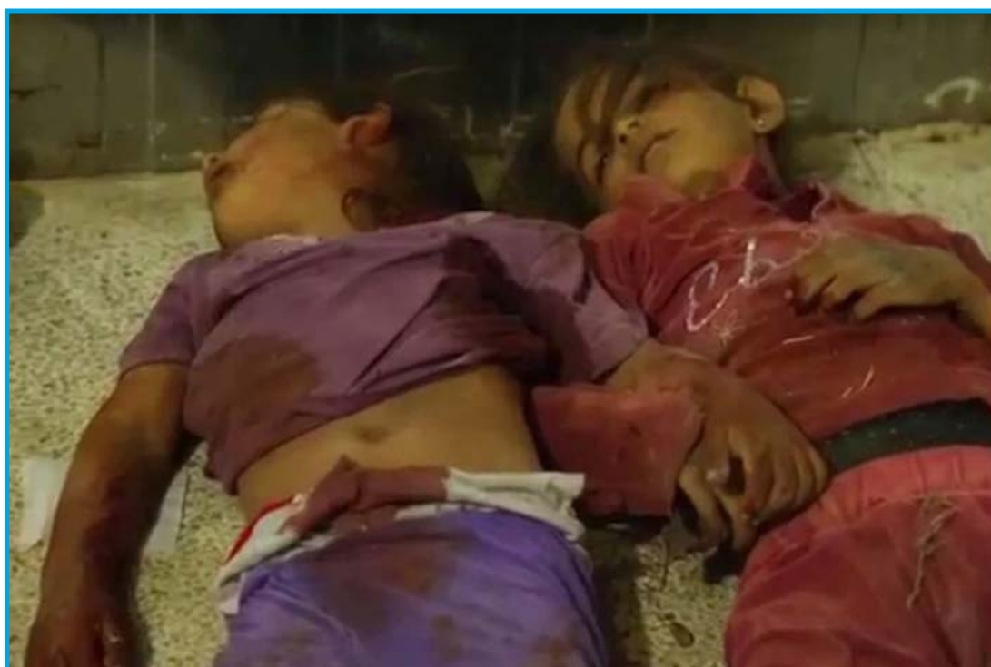
Two girls who were killed in an airstrike by international coalition forces that targeted their house in al Salhiya village – May 9, 2017

Tuesday, May 9, 2017, fixed-wing international coalition forces warplanes fired a number of missiles at a house in al Salhiya village , northern suburbs of Raqqa governorate, which resulted in the killing of 12 civilians, including four children and four women. Additionally, about 12 others were wounded. The village is currently under the control of SDF, whereas it was under the control of ISIS at the time of the incident.