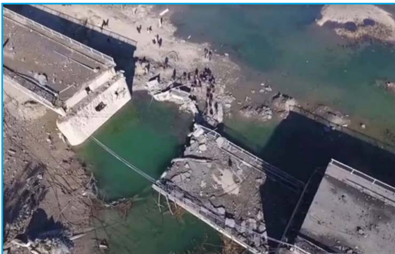
Picture from above for al Rashid Bridge in Raqqa city after an aerial attack by international coalition forces – February 2, 2017

Thursday, February 2, 2017, fixed-wing international coalition forces warplanes fired a number of missiles at al Rashid Bridge, known as al Jadid Bridge , in southwest of Raqqa city . One of the bridge openings were destroyed completely . As a result, the bridge was rendered out of commission. It is worth noting that the bridge connects the center of Raqqa city with its western suburbs. The city is under the control of ISIS.