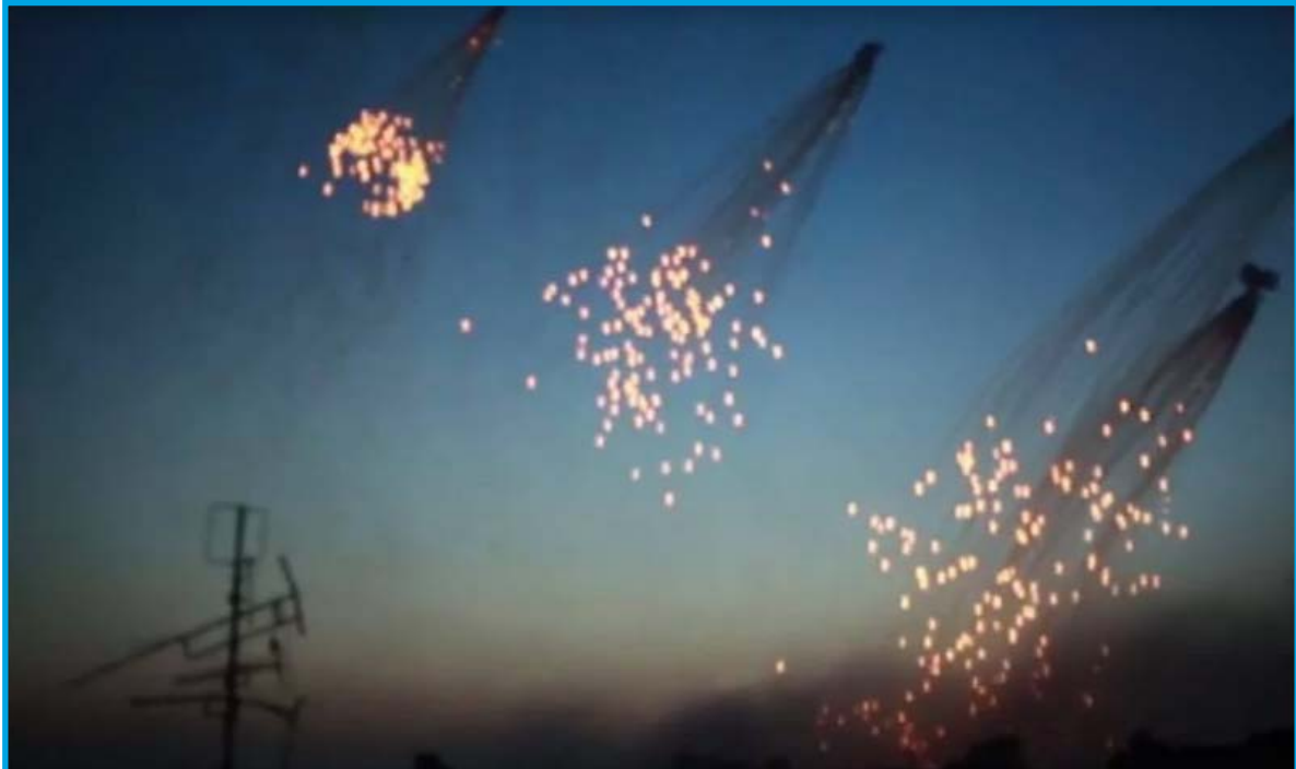
Distinguishable explosions for white phosphorus munitions in the sky of Raqqa city – June 8, 2017