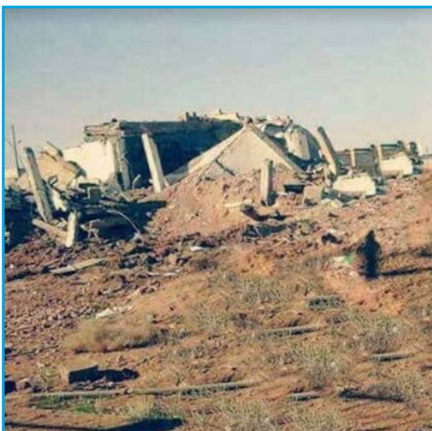
The municipal building damaged after an aerial attack by international coalition forces – February 16, 2017

Thursday, February 16, 2017, fixed-wing international coalition forces warplanes fired a number of missiles at the municipal building in al Yamama village, western suburbs of Raqqa governorate. The building was destroyed completely, and was rendered out of commission. The village is currently under the control of SDF, whereas it was under the control of ISIS at the time of the incident.