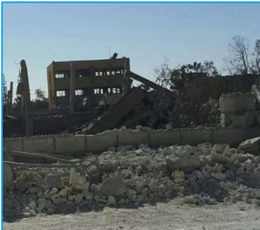
Damages at the industrial school in al Tabaqa city after it was targeted by SDF – January 21, 2017

Saturday, January 21, 2017, fixed-wing international coalition forces warplanes fired a number of missiles at al Yarmouk Industrial High School in al Tabaqa city, western suburbs of Raqqa governorate. The school building and its cladding materials were heavily damaged . As a result, the school was rendered out of commission. The city is currently under the control of SDF, whereas it was under the control of ISIS at the time of the incident.