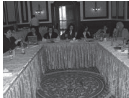
Negotiations Skills Training