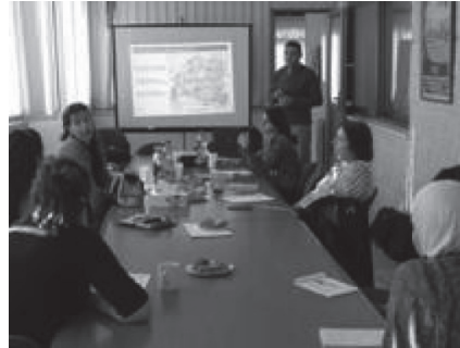
Women Political Forum Informative Sessions

The project's Steering Committee defined the selection criteria for prospective members of the Women's Political Forum and application forms were designed accordingly. Application forms and invitation letters were sent to 60 active women and 30 participants were selected to form the core group of the Forum. Selected members represent women's activists in civil society, political parties, universities and non-governmental organizations. Two preparatory meetings were held at MIFTAH's office on October 11, 2005 and November 30, 2005. The participants discussed the following: