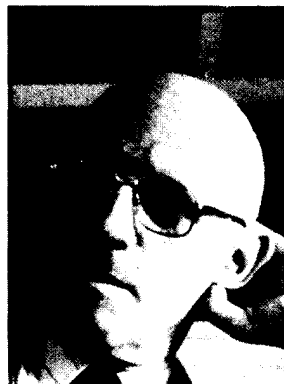
Figure 1. Michel Foucault