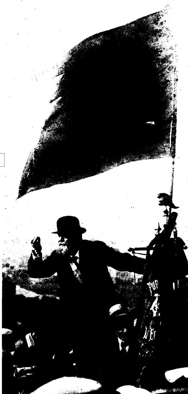
Figure 2. Jean Jaures, paragon of leftist intellectual activism, from an article by Andre Glucksmann on the psychology of pacifism.

This parity evaporated, however, in the war. On the one hand, French conservatism stood discredited not only by its xenophobic nationalism, its antiegalitarianism, and its flirtation with fascism in the prewar years, but also by the participation of many of its leading exponents in the collaborationist Vichy regime. On the other hand, the left (except for the PCF in the brief era of the Nazi-Soviet Pact) had stood squarely against fascism and the occupation. It formed the backbone and largest block of fighters in the Resistance, and among these the Communists played a commanding (if often self-serving) role. The