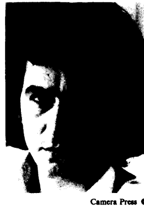
Figure 5. Bernard-Henri Levy [redacted]

The New Philosophers were motivated by two developments. First, the traditional leftist parties' pusillanimity during the student revolt of 1968 tore the scales from their eyes, causing them to reject their allegiance to the Communist Party, French socialism, and even the essential tenets of Marxism. Second, by the early 1970s most had also moved toward a searching critique of the Soviet Union, a trend accelerated by the publication in France of Solzhenitsyn's Gulag Archipelago in 1975. Under these stimuli they reexamined the entire French and European leftist tradition. Two leaders of 1968, Bernard-Henri Levy and Andre Glucksmann, wrote a number of popular books that tried to lay bare the fallacies of the leftist intellectual tradition. They argued that no socialism existed in France that was not implicitly Marxist and that all Marxist thought is ultimately totalitarian. [redacted]