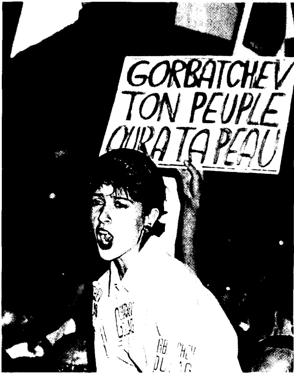
Figure 7. Students protest Gorbachev's visit to France in October 1985.

Anti-Sovietism, currently a fixture in the mentality and writing of intellectuals, continues to have great potential for stirring ferment. General Secretary Gorbachev's visit to France this fall generated protests not just from rightists: the New Left, and especially dissident intellectuals, used the visit as an opportunity to vent frustration about Soviet brutality in Afghanistan, continuing repression in Poland, and disregard of the human rights provisions of the Helsinki accord. Thousands of students turned out for Left Bank demonstrations, shouting "Gorbachev Gulag!" The Sakharov case also excites continuing fascination in French intellectual circles. Although the government probably short-circuited some planned protests by promising publicly to take the lead in broaching human rights with Gorbachev and by prohibiting street demonstrations during the visit, intellectuals nonetheless used the visit to press for the release of Sakharov and his wife and for a tougher French line with Moscow.