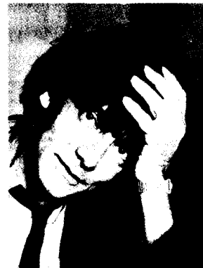
Figure 6. Andre Glucksmann [redacted]