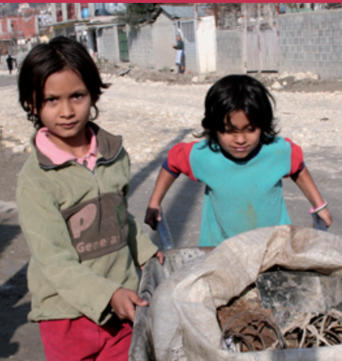
Scavenging for scrap metal - Fieri - Albania