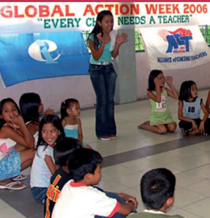
Global Action Week - Philippines 2006