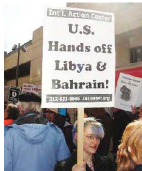
Left: Rally in Madison, Wisconsin; Below: Rally in Times Square, New York

The people of Libya and North Africa are not the enemies of the working people and the oppressed in the United States. The people in the United States must vigorously oppose the intervention by the Pentagon and NATO in the plot to topple the Libyan government. The resources utilized for war and occupation throughout the world should be rechanneled to provide jobs, housing, health-care, quality education and public services to the majority of working people and the poor. □