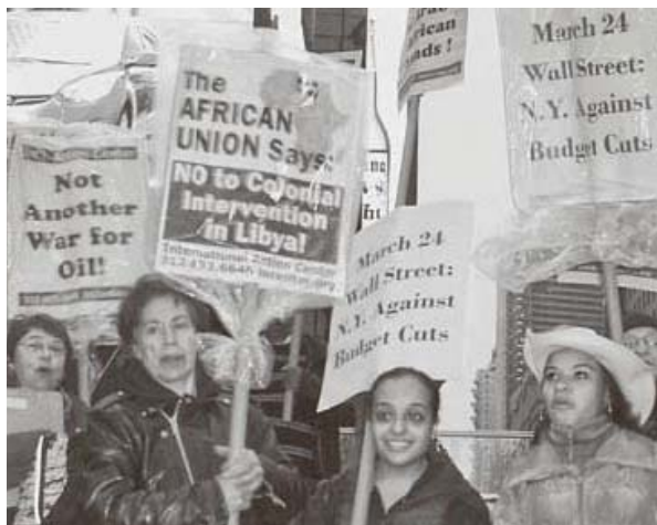
March 21, Times Square, New York City

It is vital for the U.S. political and class-conscious movement to resist the enormous pressure of a U.S.-orchestrated campaign for military intervention in Libya. A new imperialist adventure must be challenged. Solidarity with the peoples’ movements! U.S. hands off! □