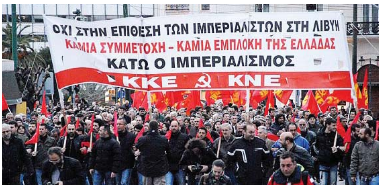
Rallies in opposition to U.S. and European attacks on Libya, in Belgrade, Serbia (top) and Athens, Greece (bottom).