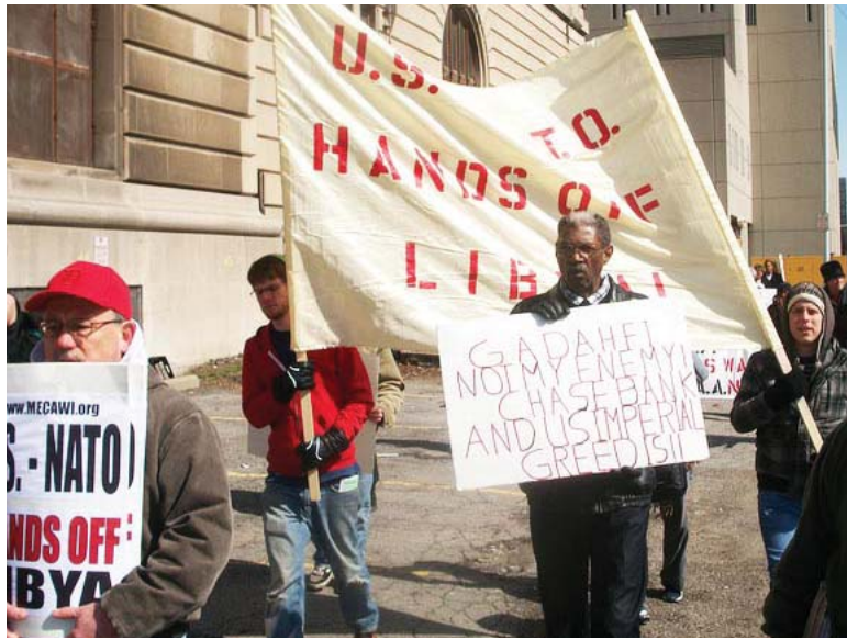
Antiwar rally in Detroit