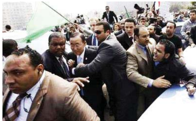
UN Secretary General Ban Ki-Moon facing angry protesters in Cairo, Egypt after the UN Security Council vote.

We must demand: No intervention in Libya! Libya belongs to the Libyan people, not to the imperialist plunderers. End all U.S. interventions and occupations and bring the troops home! Money for jobs, housing, education and health care, not imperialist war! □