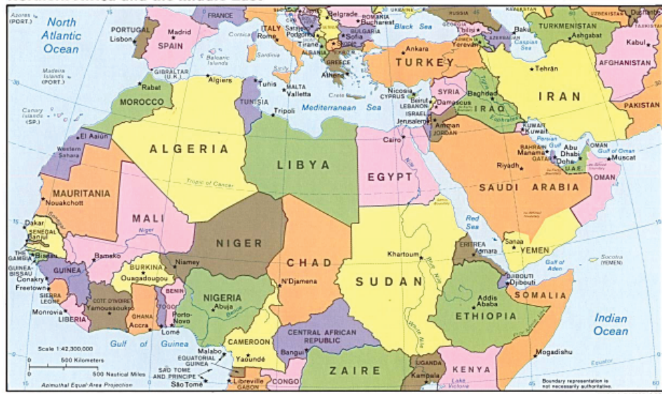
Northern Africa and the Middle East

What is their dilemma? It is this: After several weeks of fighting, Gadhafi has not been overthrown and has strong support in Tripoli, the capital city where one-third of Libya’s population lives. The rebel forces appear to be in