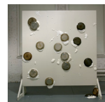
p. 53 Sara Greenberger Rafferty, Target Practice , 2006, expandable foam, pigment, pie tins, hardware, dimensions variable.