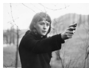
p. 10 Alexander Kluge, Abschied von gestern (Anita G.) AKA Yesterday Girl (1966)