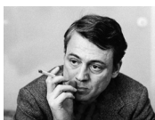
p. 10 Alexander Kluge, 1973.