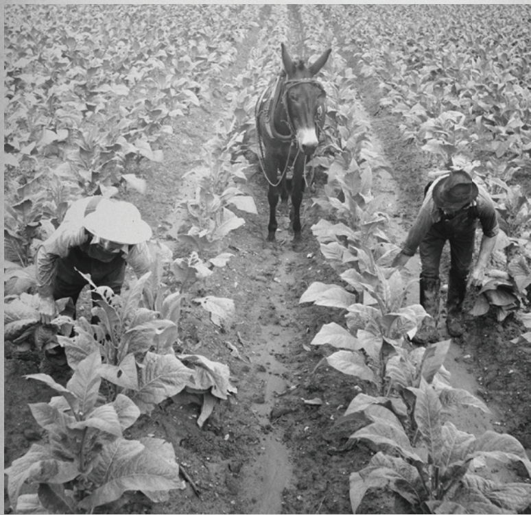
Tobacco field. Shoofly, North Carolina, 1939.