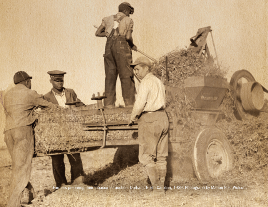
Farmers preparing their tobacco for auction. Durham, North Carolina, 1939.