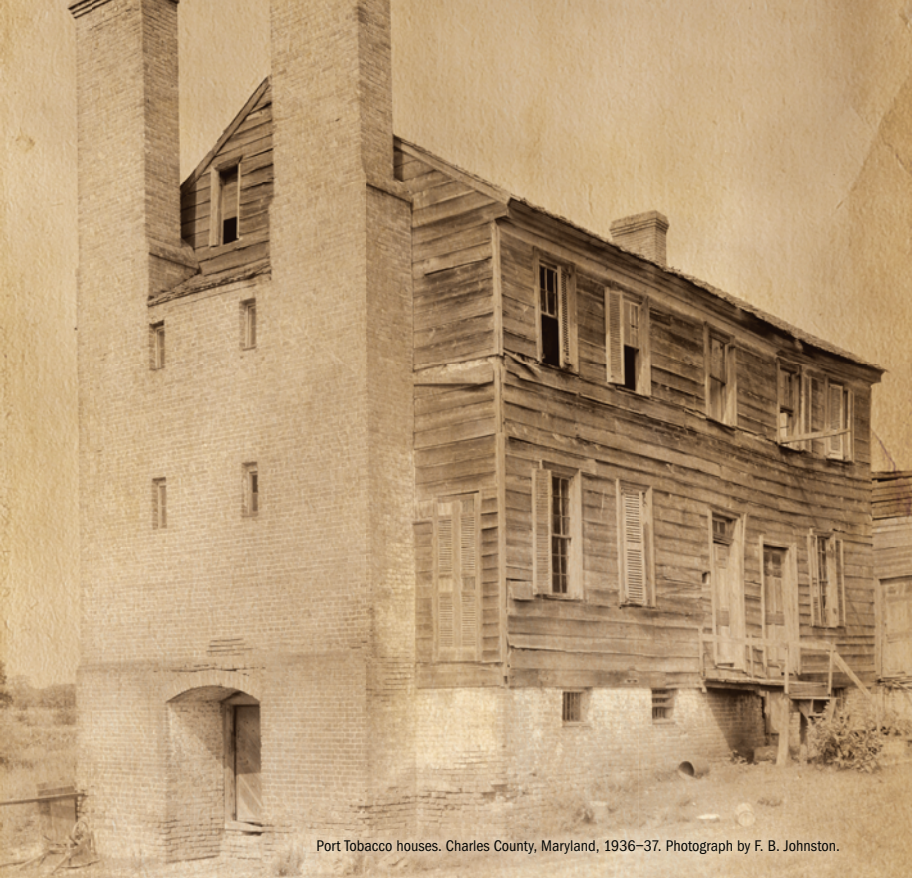
Port Tobacco houses. Charles County, Maryland, 1936-37.