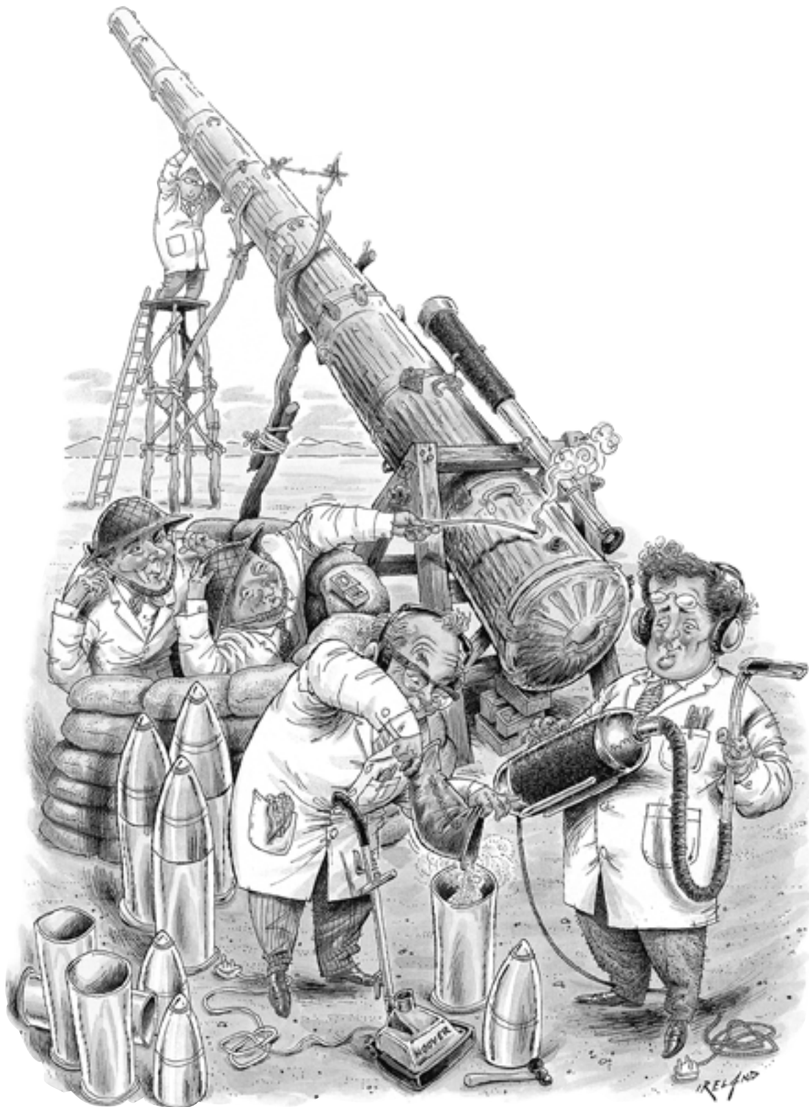
Ridicule greeted a 1992 proposal to combat global warming by shooting reflective particles into the atmosphere. The response could be different today.