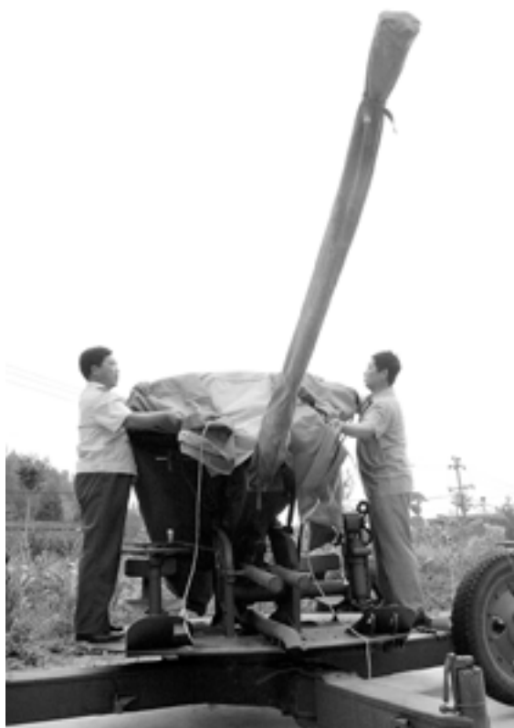
In China's active cloud-seeding efforts, anti-aircraft guns are used to shoot silver iodide crystals into the atmosphere. Beijing promises an intensive effort to clear the skies when the city hosts the Olympics in 2008.

In September 2001, the U.S. Climate Change Technology Program quietly held an invitational conference, “Response Options to Rapid or Severe Climate Change.” Sponsored by a White House that was officially skeptical about greenhouse warming, the meeting gave new status to the control fantasies of the climate engineers. According to one participant, “If