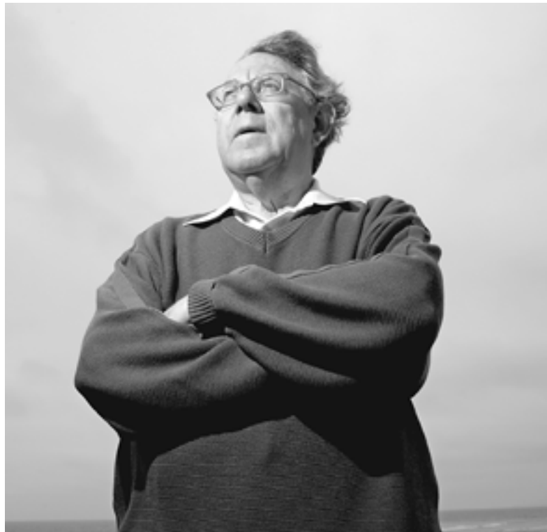
Nobel laureate Paul J. Crutzen favors a planetary “shade.”

As the sole historian at the NASA conference, I may have been alone in my appreciation of the irony that we were meeting on the site of an old U.S. Navy airfield literally in the shadow of the huge hangar that once housed the ill-starred Navy dirigible U.S.S. Macon . The 785-foot-long Macon , a technological wonder of its time, capable of cruising at 87