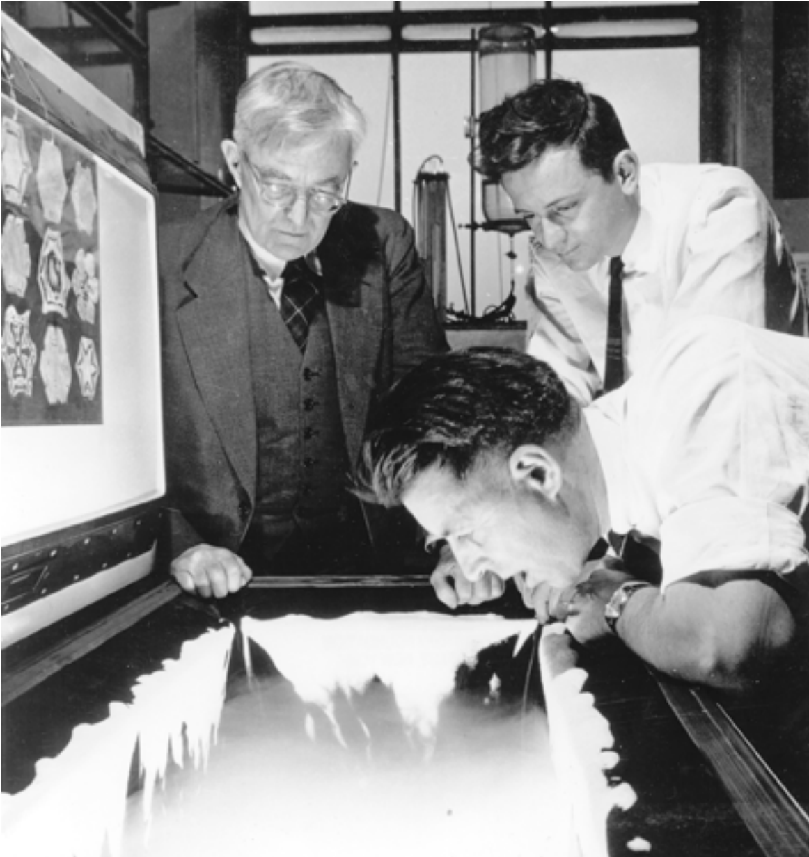
Vincent Schaefer reenacts the chance 1946 discovery that sparked fresh weather-control experiments as Irving Langmuir (left) and Bernard Vonnegut watch.

From this moment on, in the press and before the meteorological community, Langmuir expounded his sensational vision of large-scale weather control, including redirecting hurricanes and changing the arid Southwest into fertile farmland. His first paper on the subject used familiar military terminology to explain how a small amount of “nucleating” agent such as dry ice, silver iodide, or even water could cause a “chain reaction” in cumulus clouds that poten-